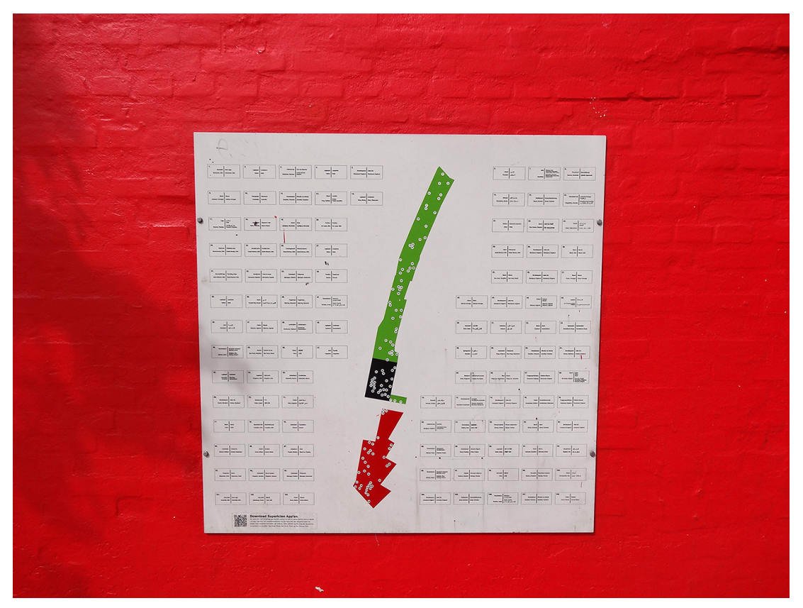
Figure 5. Sign on the wall showing the location of the 108 objects at Superkilen. All object are named in Danish and their original language.