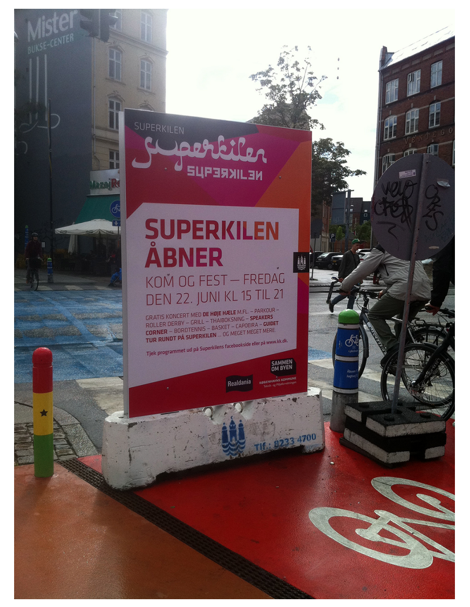
Figure 4. 'Superkilen is opening: Come and party': Billboard announcing the opening of Superkilen, June 2012.

highlighting the universal and designing for transversal connections.