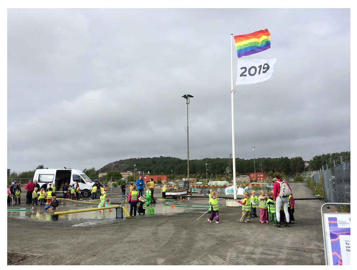
Figure 2. Open call with children: Investigating what a future playground could be in scale 1:1 (2018).