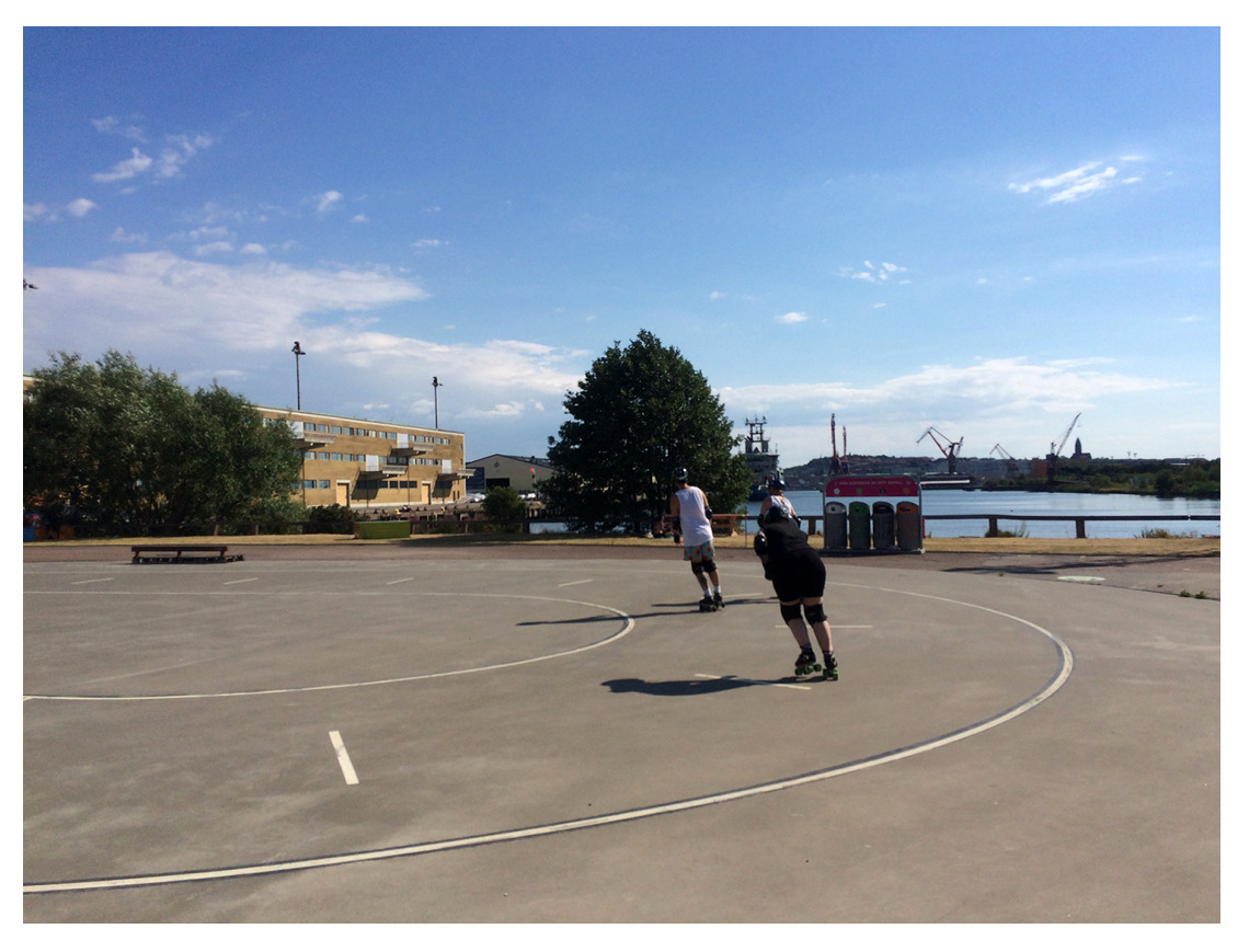
Figure 3. Roller derby training at Jubileumsparken (2018).