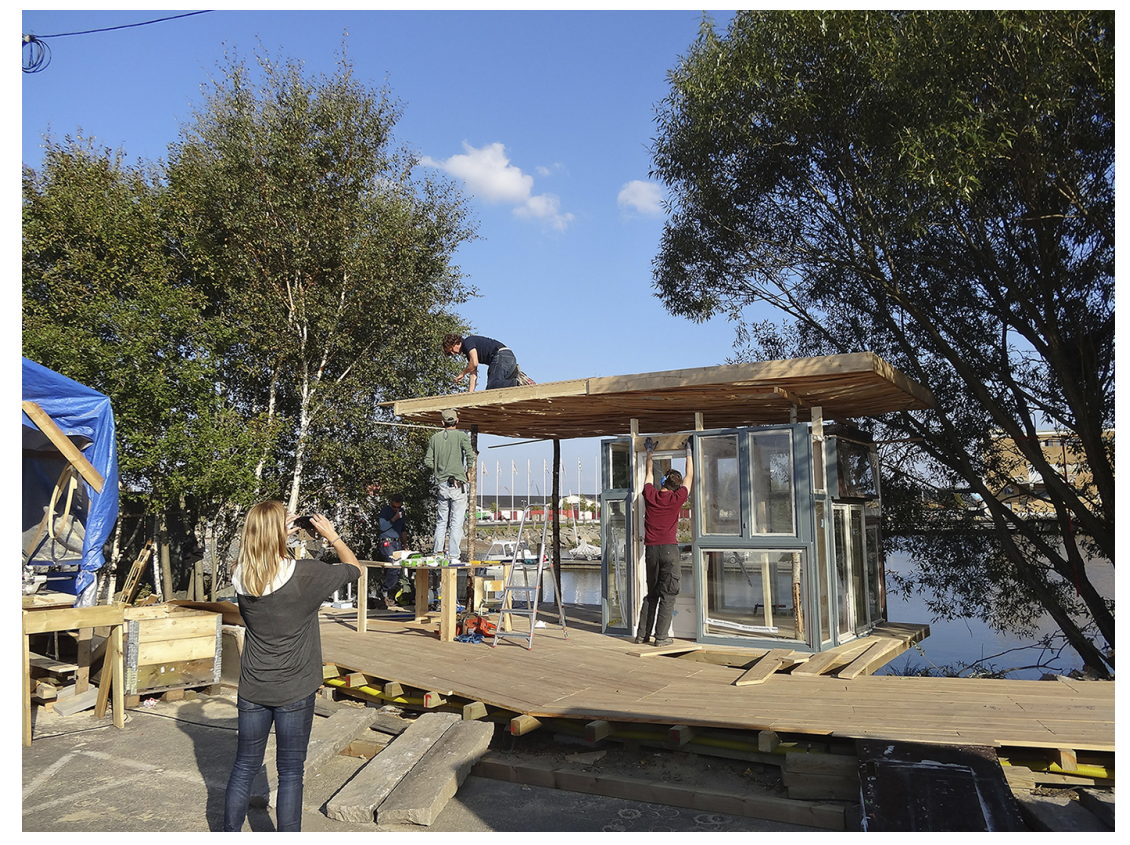
Figure 1. Building a small library pavilion during a public workshop at Jubileumsparken (2014).