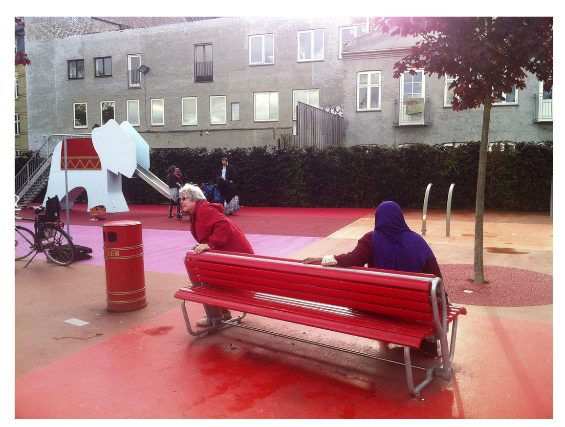
Figure 6. Objects at Superkilen: A British litterbin, a bench from Zurich and an elephant slide from Pripyat, the abandoned town for workers at Chernobyl (2015).