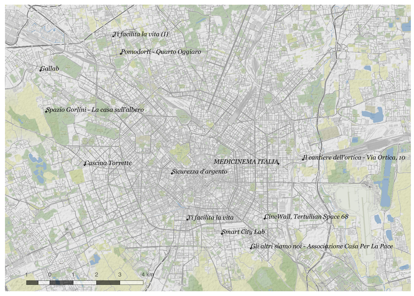
Figure 1. Civic crowdfunding realised projects in Milan, 2018.

very top-down organized and I see that people around me have the need to determine more about their own living environment. Platforms allow citizens to participate and foster bottom-up actions. (Juan-Carlos Goilo, Municipality of Amsterdam, personal communication, July 2018, translation by the authors)