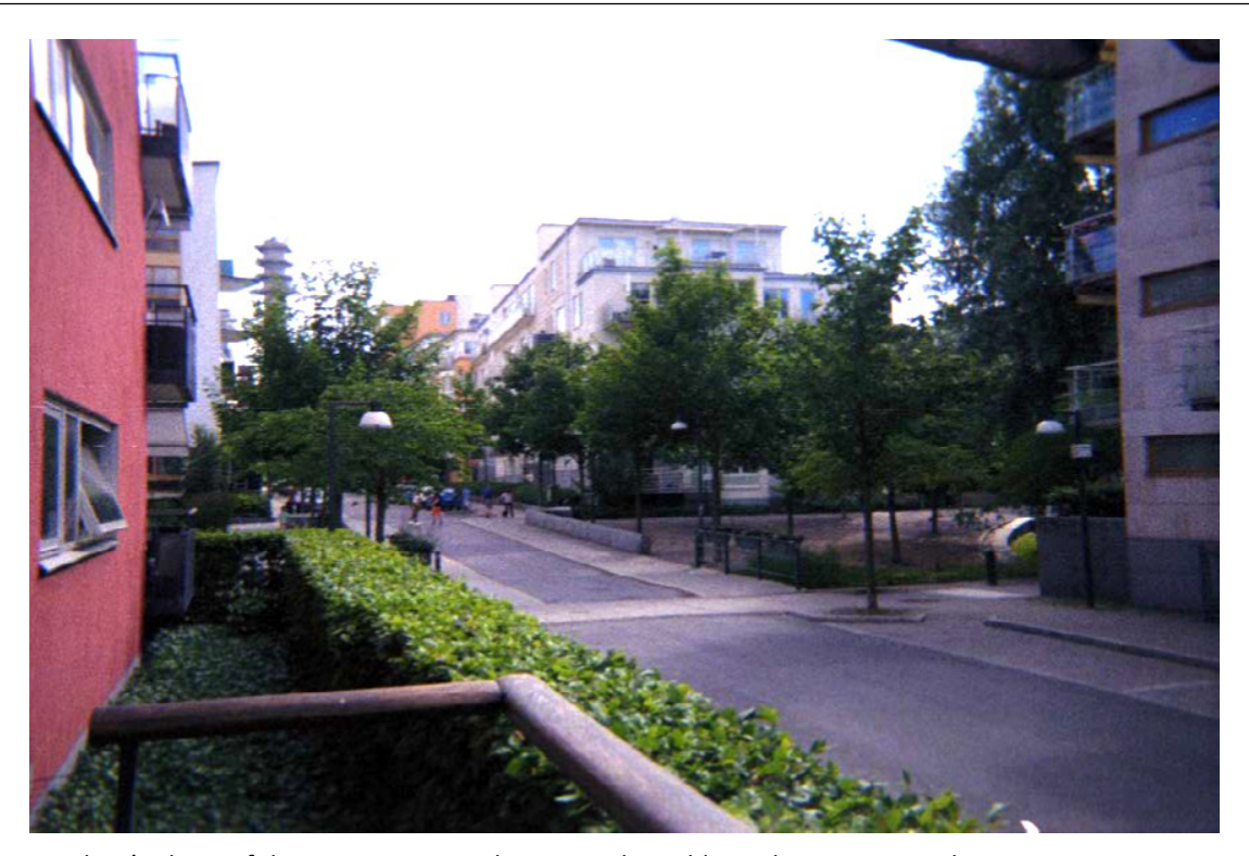
Figure 4. Resident's photo of their private space that views the public realm.

lived experience in relation to Sankt Erik and Hammarby Sjöstad display a similar fluidity in the navigation of human and architectural bodies.