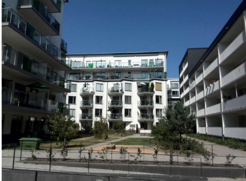
Figure 3. Hammarby Sjöstad.