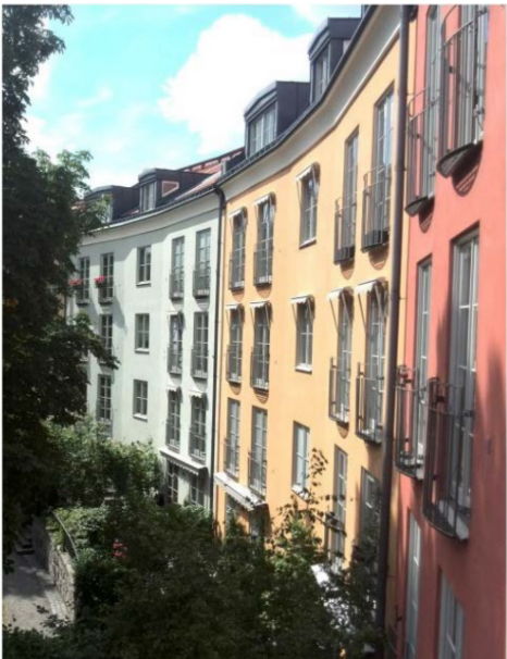
Figure 2. Sankt Erik.