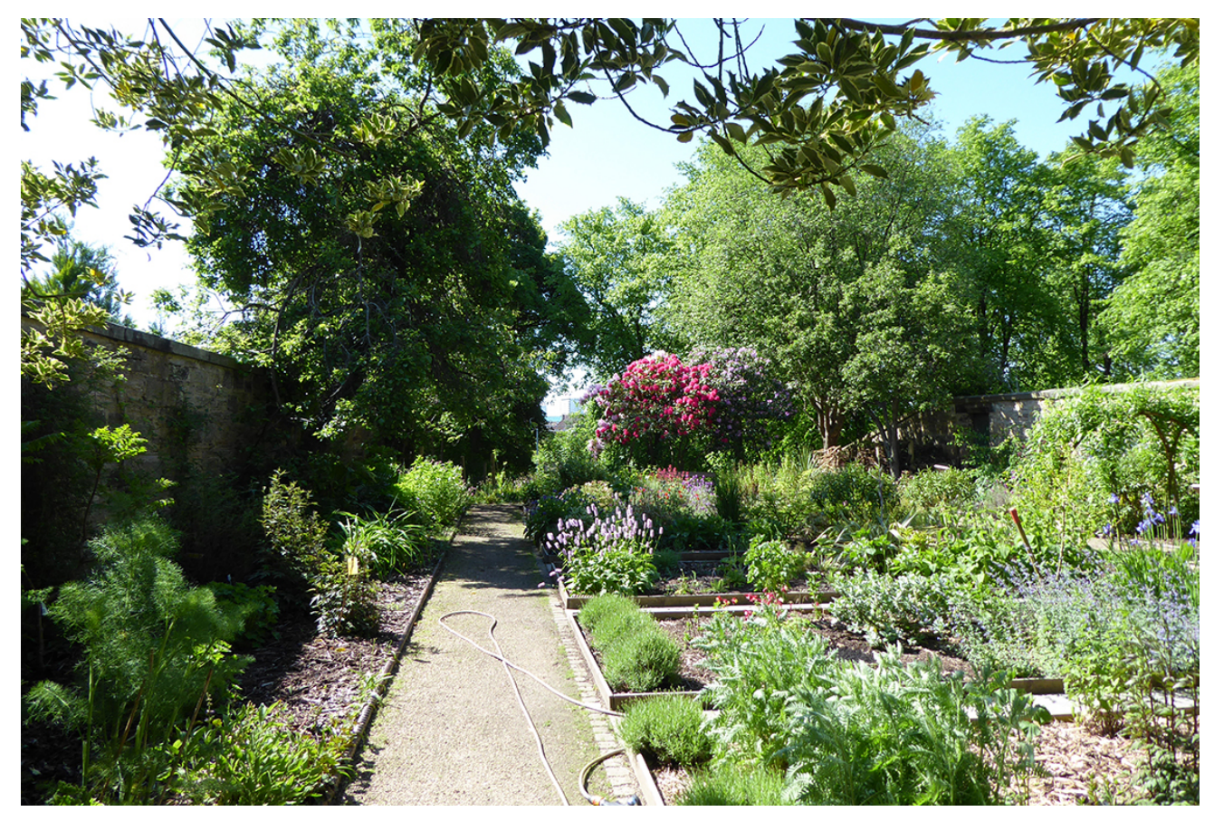
Figure 7. The walled garden at the old asylum.

This participant had worked at the general hospital before getting ill, but never visited this 'secret garden.'