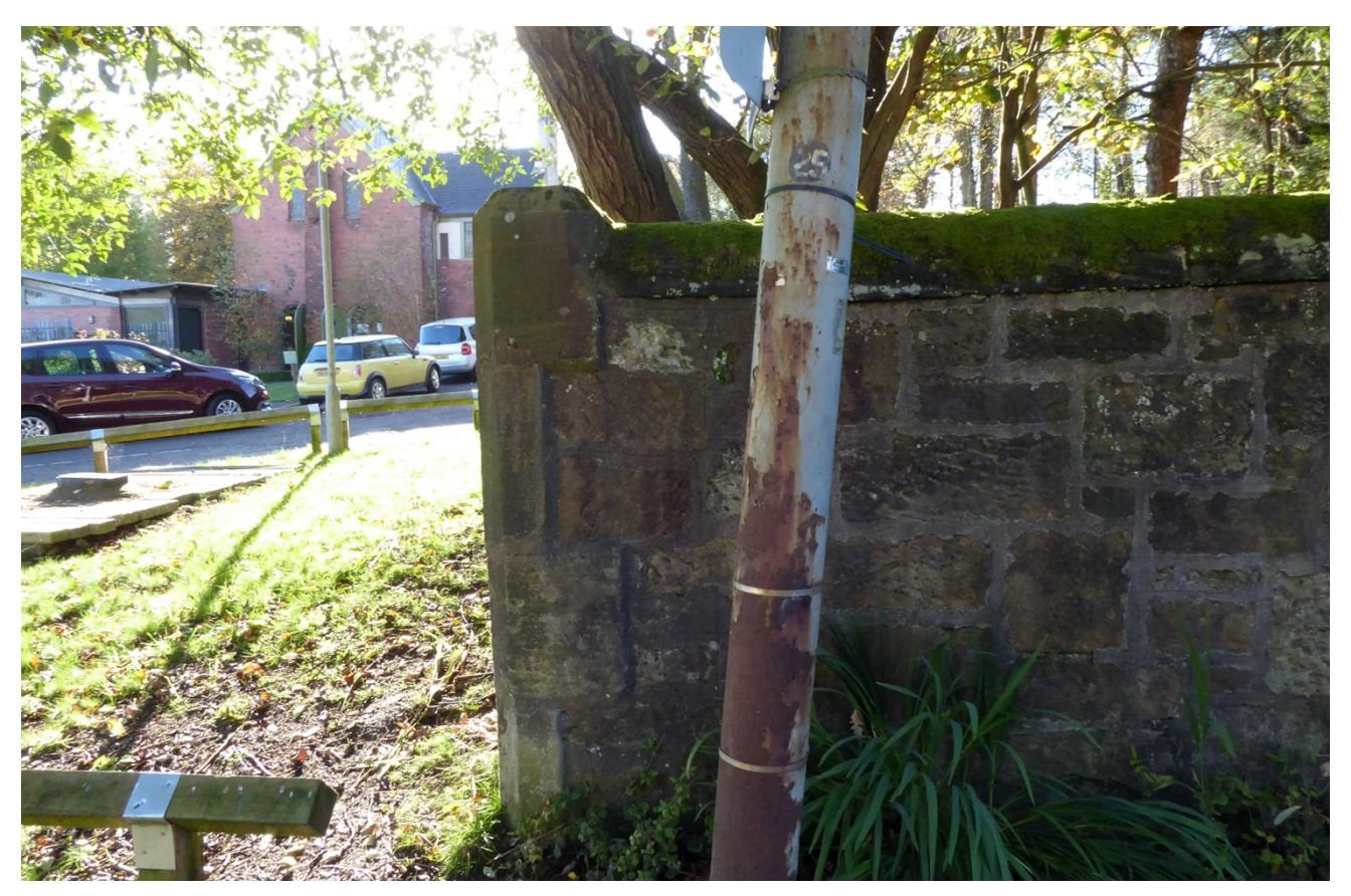
Figure 1. The perimeter wall once constructed to enclose the entire grounds of Gartnavel Royal Hospital.

Indeed, Gartnavel as 'outsider' is suggested in Pacione's (1983) Glasgow-based study of neighbourhood communities. Pacione, searching for factors promoting social cohesion, sought to identify neighbourhoods in the city's 'greater West End' with established boundaries as perceived by local residents. Fascinatingly, a few areas came forward as 'unclaimed,' eccentric to what were perceived as neighbourhoods where people 'belonged,' including a few industrial sites, a former harbour area and our own area of inquiry, Gartnavel (Figure 2). Clearly outside citizens' perceptions of what constituted a 'neighbourhood community,' institutional areas like Gartnavel have a history of being perceived as empty, blanks on the map, or even as feared, stig-