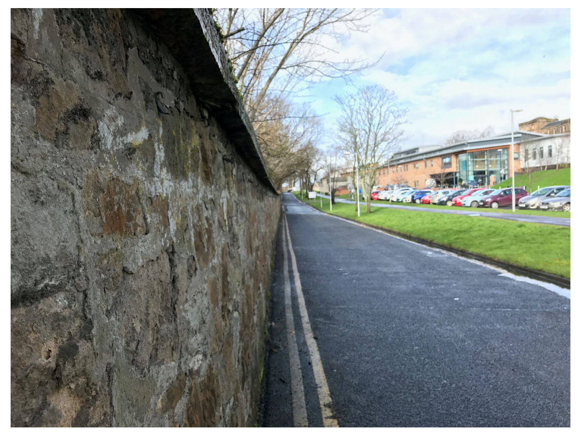
Figure 5. Perimeter wall and the new psychiatric facility at Gartnavel, designed by Macmon architects.