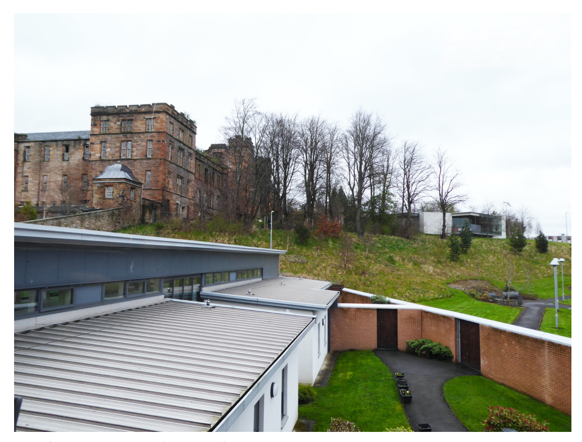
Figure 4. View from NGRH towards 'old asylum' on the hill and its empty and derelict East House. To the right, behind a curtain of mature trees, Glasgow's Maggie's Centre (opened 2011) is crouching.