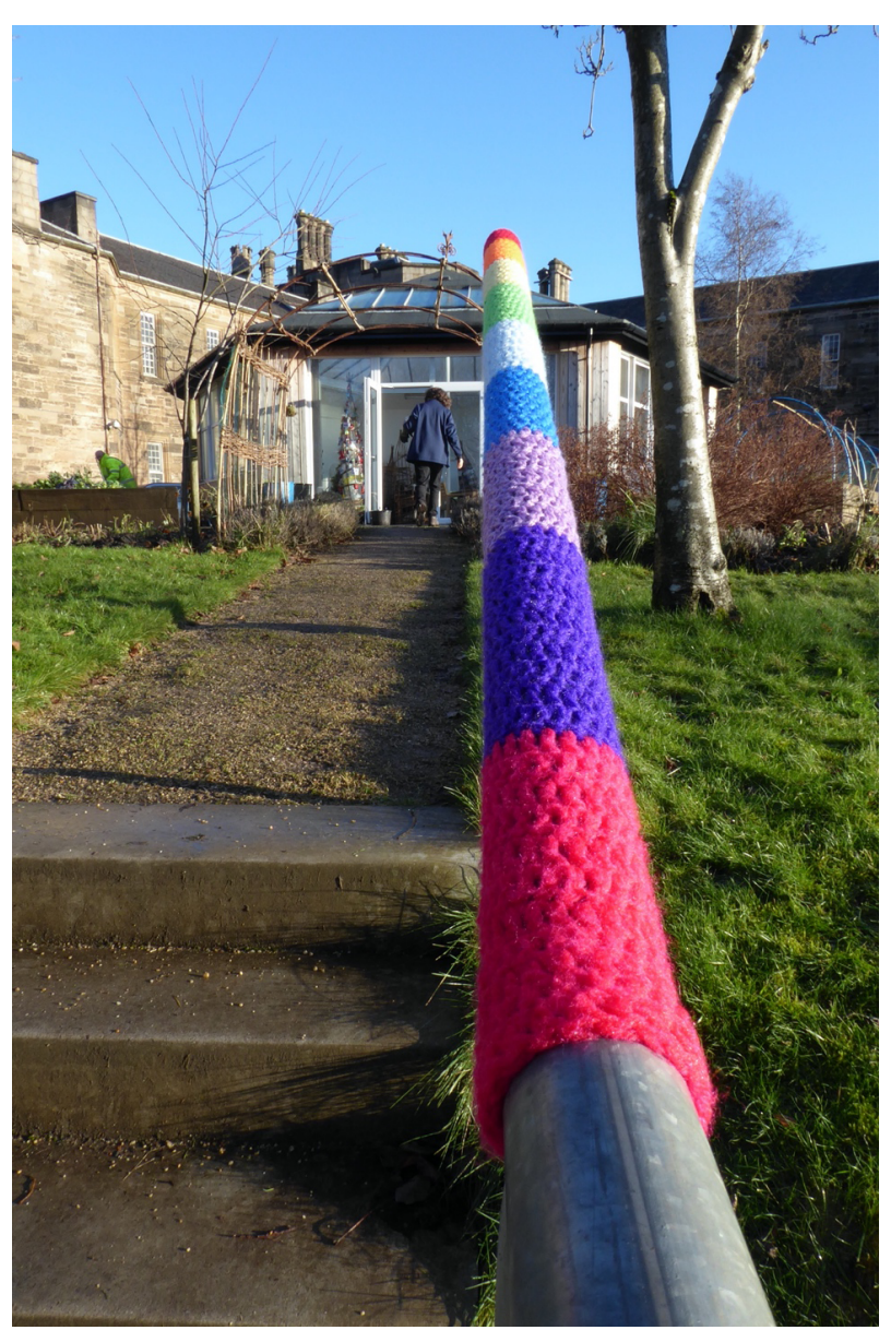
Figure 8. Just besides the Walled Garden, with the old asylum's West House as background, the gardening groups have their greenhouse and cultivation boxes. Someone thought the handrail needed a protection against the cold metal.

We have worked towards an interpretation of the variegated mental healthcare campus—and its historical antecedent, the asylum—as a 'site' of much more variation and ambiguity, a "hybridity" (Burns & Kahn, 2005, p. xxi), than is initially given to the imagination (with or without knowledge of historical twists in mental healthcare), and one more connected to the urban built envi-