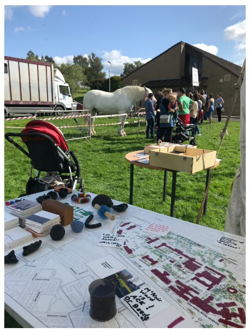
Figure 6. The annual festival Over the Wall at the hospital grounds in August 2018 with horses, theatre, music among other things. In the foreground our pop-up exhibition The Gart Game.

This respondent saw patients walking in their dressing gowns and he and his friends used to laugh at them. He knew it was a mental hospital, but predominantly for him it was a place of recreation, a place effectively belonging to the neighbourhood where he could play football. For him, therefore, both a 'straight line' against the stigmatised inmates and an entitlement to jump the