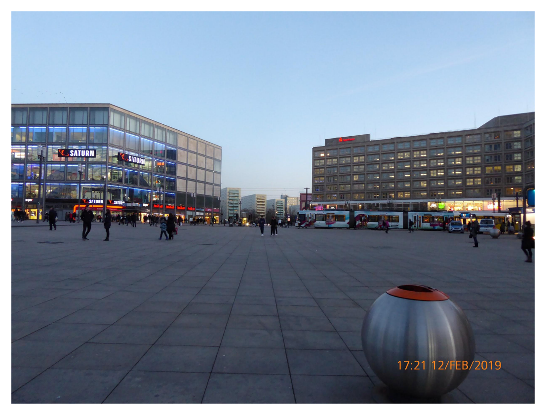
Figure 3. Alexanderplatz.