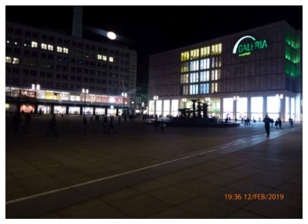
Figure 5. Fountain of Friendship between Nations at the Alexanderplatz in the dark.

be excluded in the measurements of sound, light and distances. For this purpose, we performed 13 measurements on 4 different days at different times at Alexanderplatz to compare and verify the values.