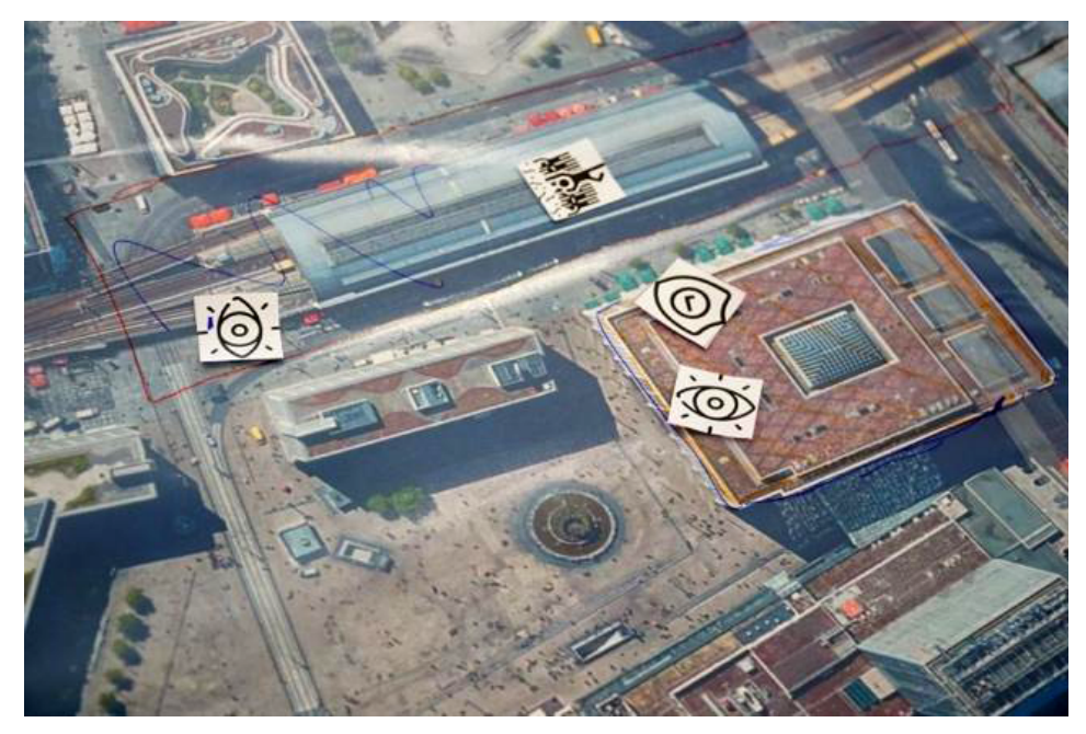
Figure 4. Participatory mapping for security perceptions.