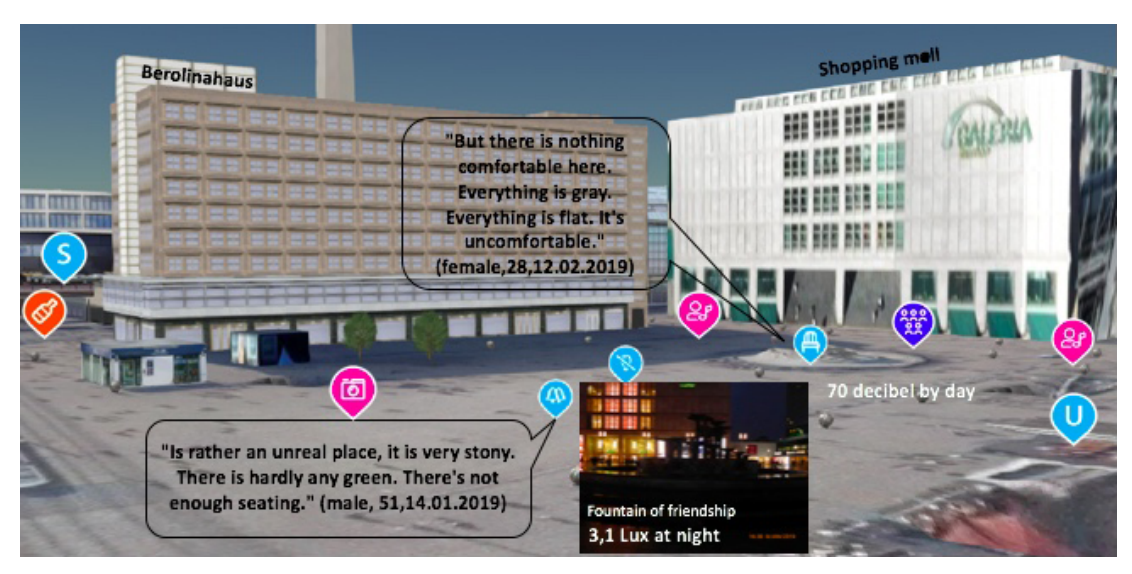
Figure 7. Hybrid map of security perception in public areas.

areas are characterised and related. However, the representation of the perceptions by icons can only be used temporarily because the perceptions of the users can be influenced by seasons, day and night times and short-lived changes on site. This form of presentation is quite new and represents an added value for experts. However, it must be considered that stereotypes and