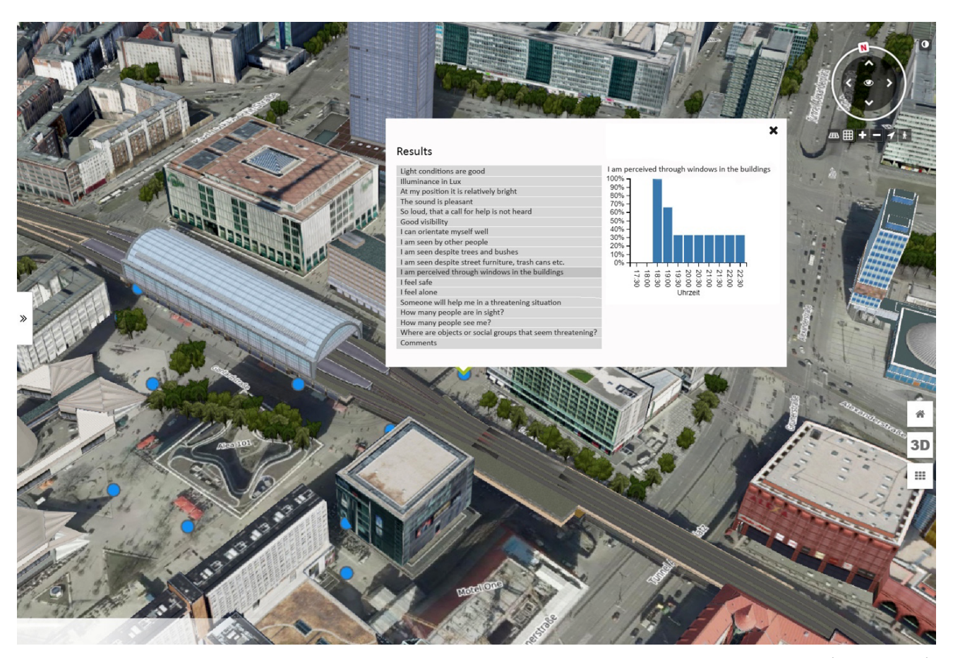
Figure 2. Questionnaire survey on security perceptions at Alexanderplatz. Source: VirtualCitySystems GmbH (Background).

perceptions, the use of space and its conflicts of use, measures and best practices. From the expert interviews, the first structural-spatial factors in the study area were determined. The following two expert statements concerning the Alexanderplatz confirm the results from the user route observation and the questionnaire collection: