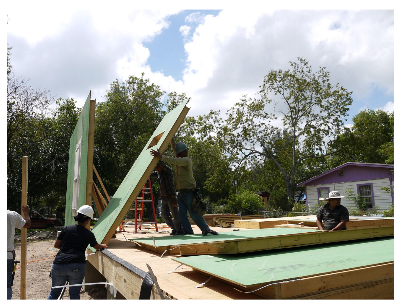
Figure 1. Photograph showing the installation of SIPs in the core of a RAPIDO prototype home.

assisting the household in understanding the multitude of design decisions involved in a design process, as one bcWORKSHOP designer stated: