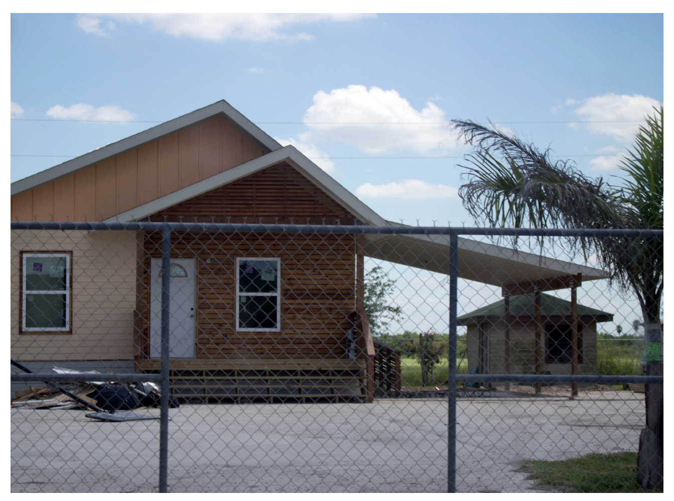
Figure 3. Nearly completed RAPIDO prototype home, designed using a sustainABLEhouse model, under construction in a colonia north of Weslaco, Texas.

motion the adoption of RAPIDO as not just a design proposal, but, as a bcWORKSHOP designer states, disaster preparedness: