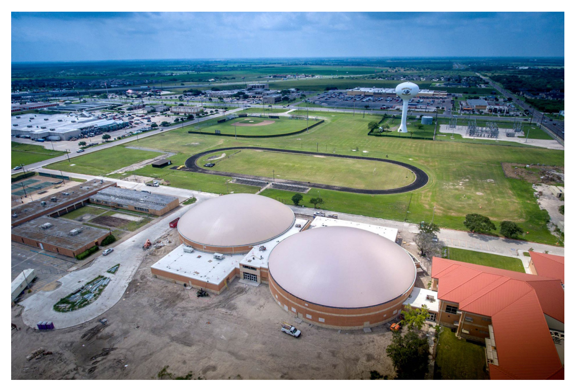
Figure 6. Kingsville Independent School District Community storm shelter in Kingsville, Texas, on the Gulf Coast.