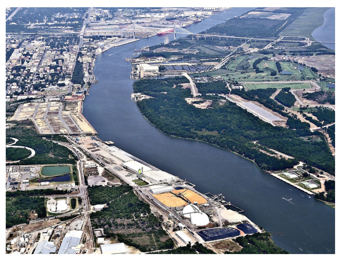
Figure 3. Peeples Industries—Wood Pellet bulk storage at the East Coast Terminal on the Savannah River.