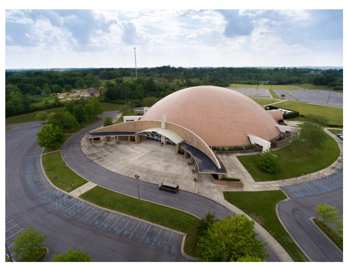
Figure 7. 73-ft high dome at Faith Chapel in Birmingham, Alabama, completed in December 2002. Source: Dome Technology (2021).

Figure 6. Kingsville Independent School District Community storm shelter in Kingsville, Texas, on the Gulf Coast. Source: Dome Technology (2021).