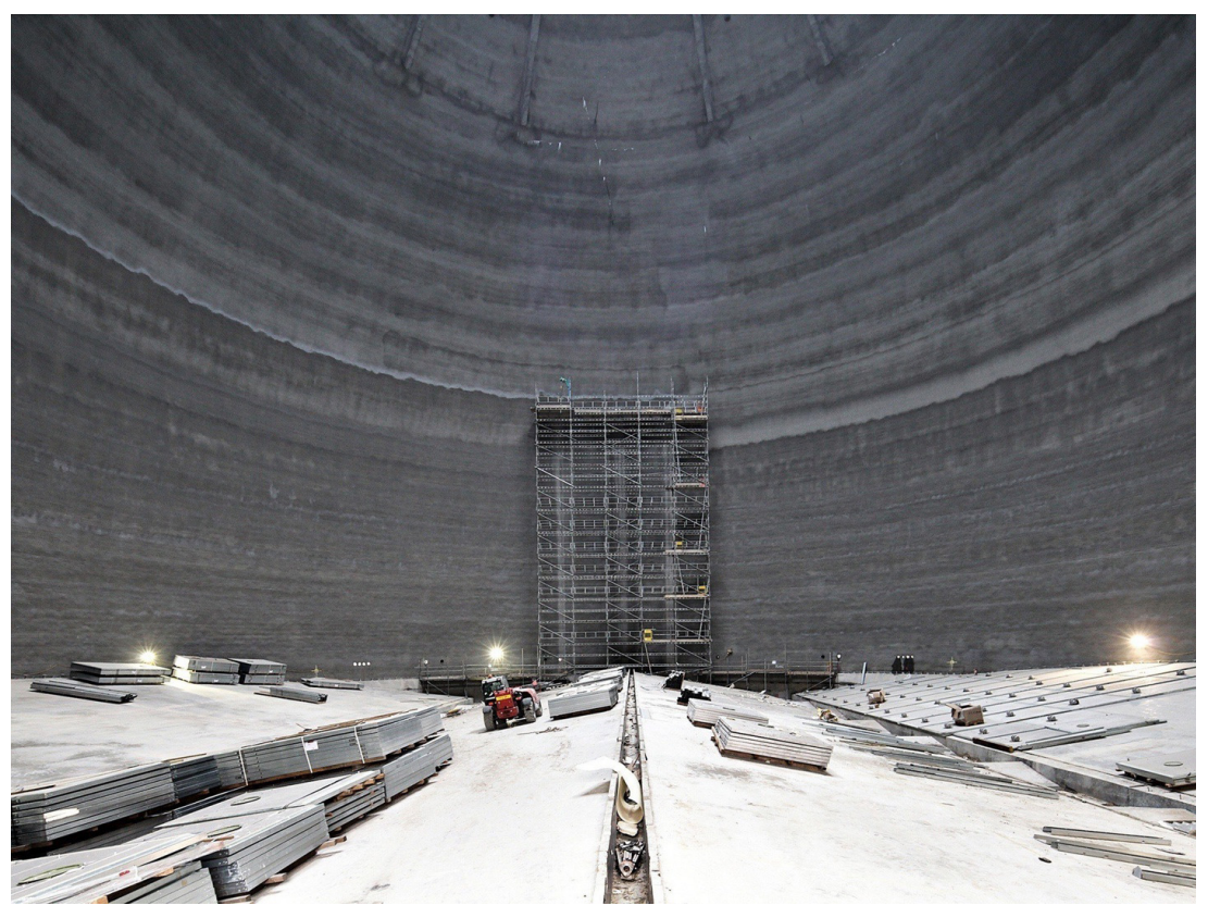
Figure 2. Dome silos under construction at the 20 Power Station in Selby, North Yorkshire, England.