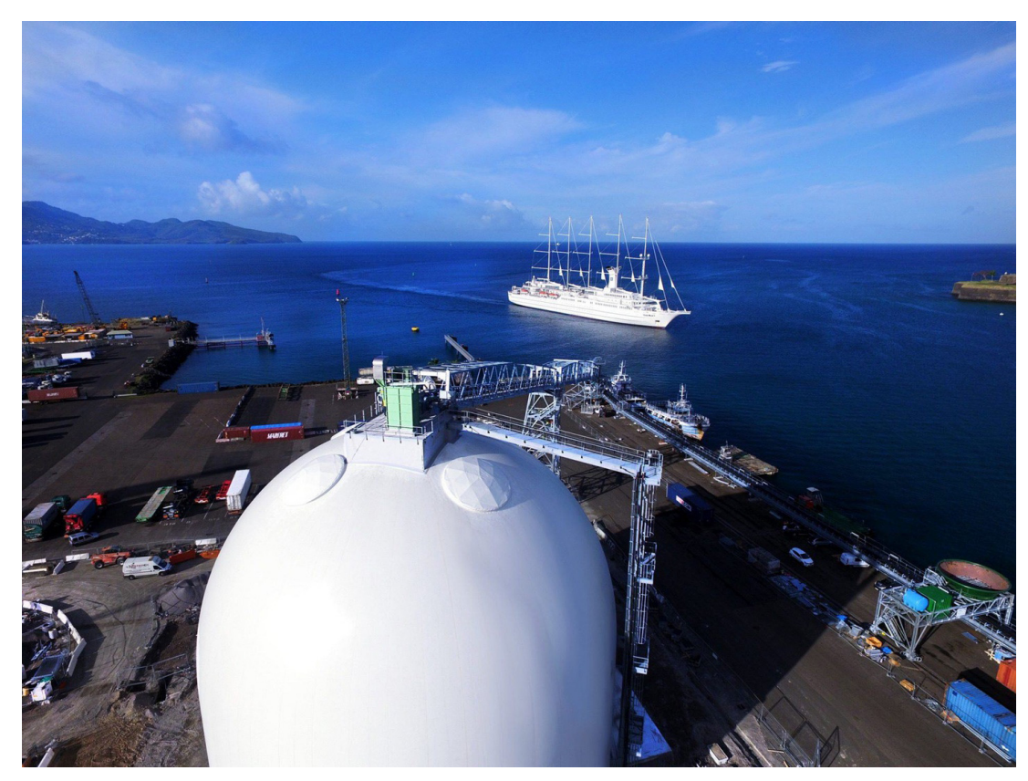
Figure 5. Albioma Wood Pellet Dome in Martinique.