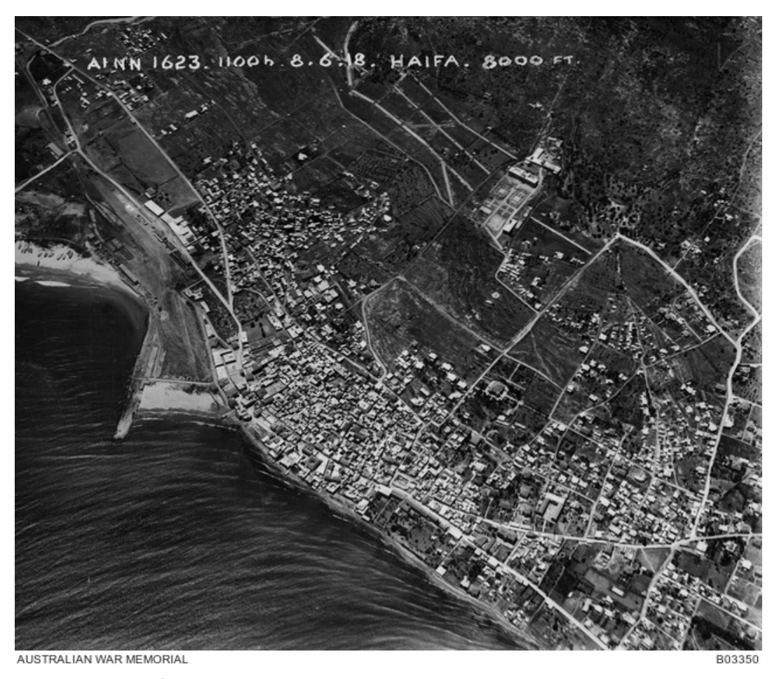
Figure 4. Aerial photographs of the Australian Air Force photographed on June 8, 1918.

2018; Yazbak, 2000). Haifa transformed from a regional Ottoman port city to a British economic and strategic colonial entry port to the oil-rich Middle East and India reflected on Haifa as part of the British empire (Mitchell, 2003), evident in the map of 1934 (Figure 5).