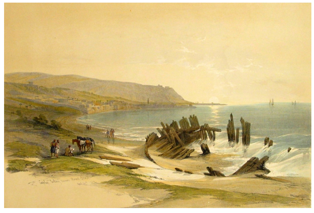
Figure 1. Haifa, looking towards Mount Carmel, April 1839.

The Ottoman administration and residents aimed to transform Haifa into the modern centre of northern Palestine (Yazbak, 1998). At Haifa's quiet bay, several European shipping companies loaded agricultural