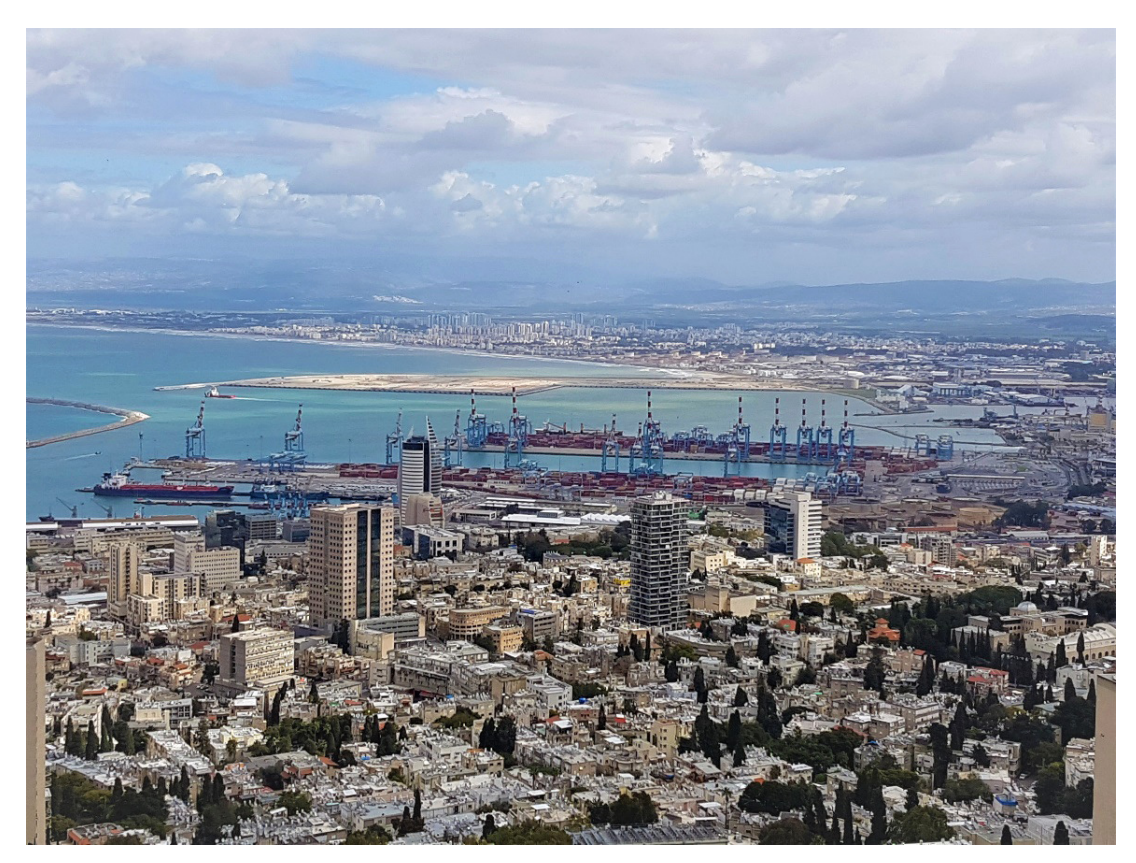
Figure 9. Haifa Port during the construction of the landfilled area for the Chinese petrol-harbor in 2020.

At the same time, Haifa's porosity to global corporate trade via infrastructure for mega container ships marginalizes local interests and concerns. Increased awareness of the oil industry's impact on the global climate crisis, a growing number of Haifa's citizens and environmental organizations attempted to resist the government's aspiration to expand fossil energy use and construction of the new Chinese port. New research on the connections between the oil industry, air, water, and soil pollution and public health (Nave & Kuperman, 2016; Spector Ben-Ari, 2014; Wolfson et al., 2020), risk of earthquake in the Haifa Bay, and the threat from terrorist