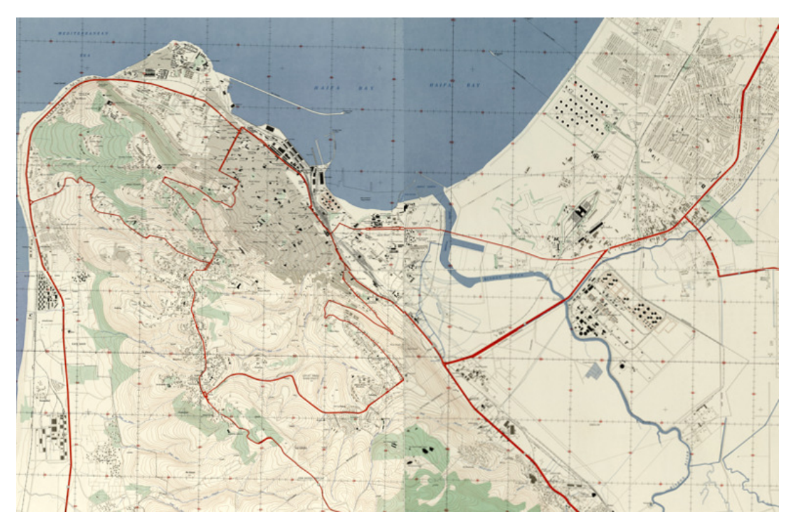
Figure 7. Haifa, 1958.

As the main port for the regionally isolated Israeli state, Haifa's became the main national port for entry