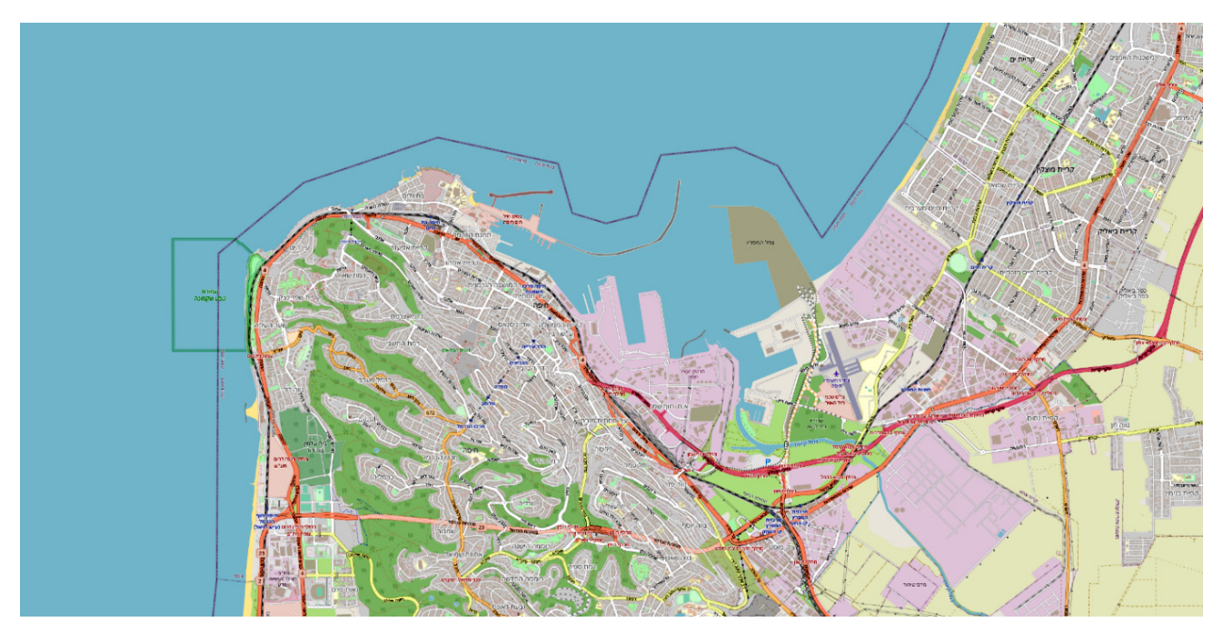
Figure 8. Haifa, 2021. Note: Chinese-corporate port in grey.

Today, 98% of Israel's foreign trade passes through seaports. International trade constitutes more than 60% of