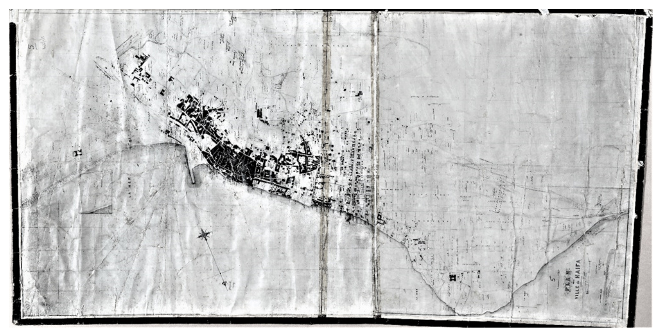
Figure 3. Haifa, 1911.