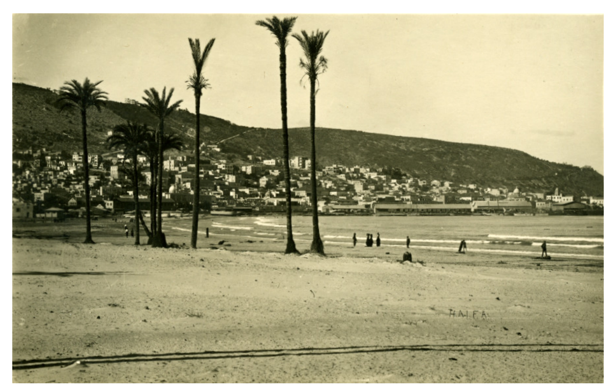
Figure 2. Postcard