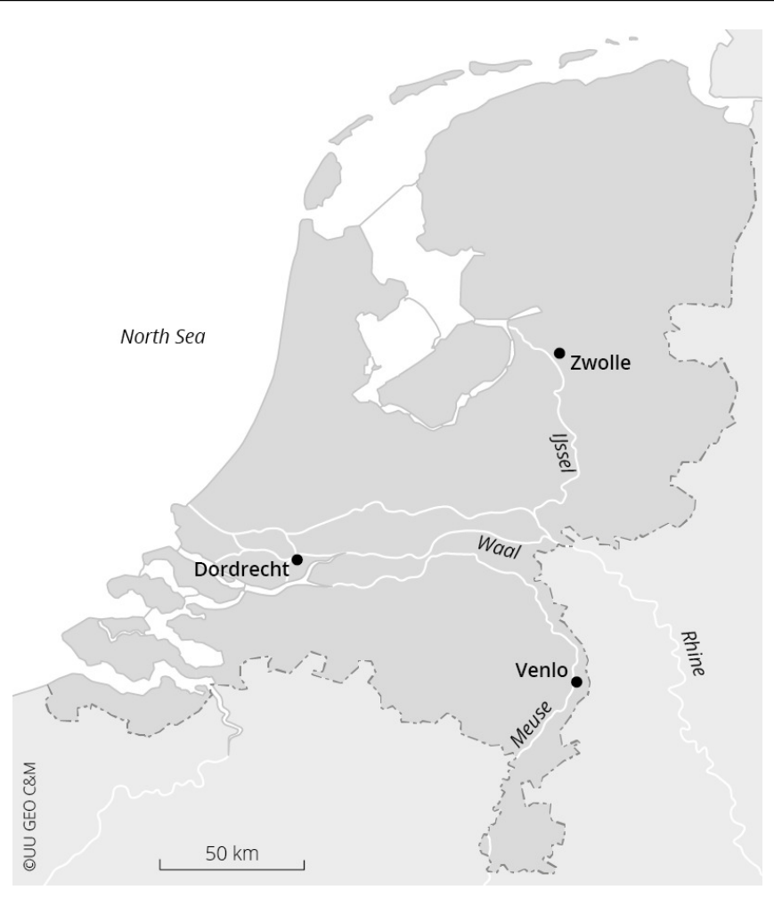
Figure 3. Case study locations within the Netherlands.

positively. Only the different kinds of information are valued differently. The informative role of floods, in general, is valued more negatively than positively. Also, the informative role about flood impact specifically for the own dwelling of the respondent has more negative than positive answers. The informative role about potential measures is valued more positively, although nobody indicates that he or she is planning to actually implement any of the measures presented. In that sense, the analytical support can be considered as low. As respondent 12 states: "Beforehand I had no clue about flood risks, so compared to that I did get a little grasp from it, but I will not call myself an expert on floods, not at all."