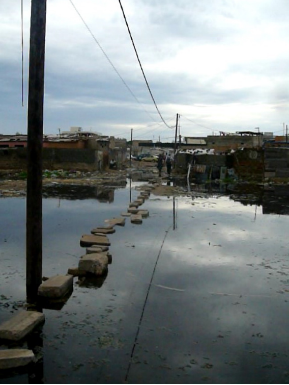
Figure 2. Leona (left) and Messere (right) today. Note: Entire sections of the city are now covered by water and typhas . Only the abandoned houses and businesses on the edge of the niaye (former wetlands) and the electric poles that sometimes emerge from the vegetation allow us to grasp the presence of old neighbourhoods in these areas.