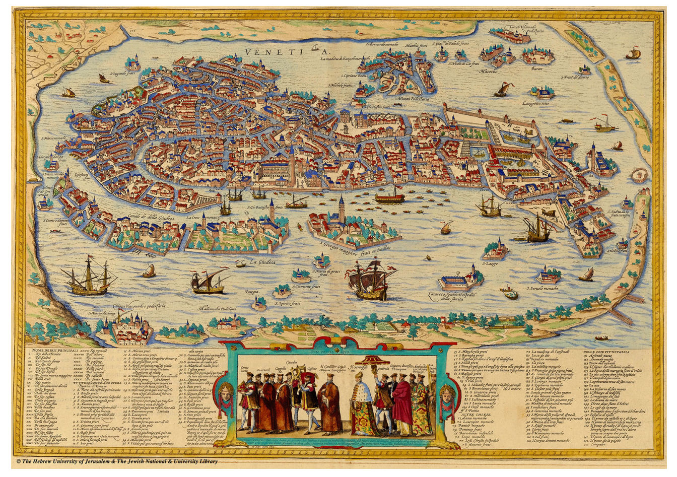
Figure 3. Map of Venice, 1572, by Georg Braun and Frans Hogenberg.

environment. Safeguarded spaces of transshipment and warehousing facilitated the throughput of goods, rather than the port's integration into the nearby territory. First warehouse districts, then office districts, and occasionally dedicated housing areas became homes for maritimerelated functions. Administrative districts such as the Kontorhaus district in Hamburg are icons of these growing mono-functional pores in the tissue of the city. Gates to port districts and some other multifunctional public places have continued to serve as sites of exchange.