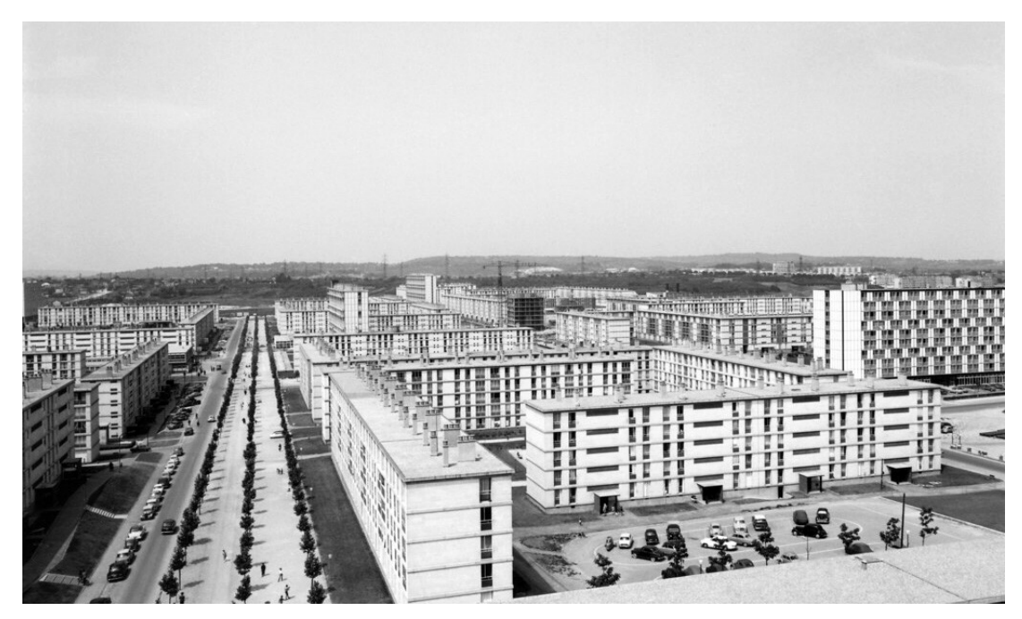
Figure 2. Sarcelles, an emblematic case.

who placed self-esteem at the very top of the pyramid of needs. Indeed, if "needs" refer to physiological factors, "aspirations" express the attachment of a social group to their space. This also conforms to the principles of social morphology analysis established by Maurice Halbwachs and Marcel Mauss, founders of housing sociology. Halbwachs considered that "the material forms of society act upon it, not by virtue of a physical constraint, as a body would act, on another body, but by consciousness that we take of it" (Halbwachs, 1938, pp. 182–183).