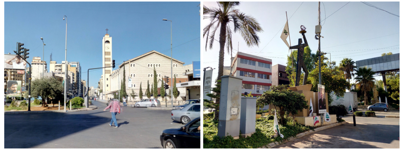
Figure 3. Representational spaces: Photographs of religious and political figures within designed road medians in Chiyah (see Figure 1 for the exact location).

ordinated "conceived" public spaces, scattered around rather than equitably distributed. Urban planning was also used as a tool by politico-sectarian parties to serve their communities and delineate their territories, consequently forming new frontiers (Bou Akar, 2018). These initiatives included the refurbishment of inherited public spaces such as the Corniche and Sanayeh Garden. Except for the Corniche, these central spaces were not "perceived" in people's daily lives due to control mechanisms, namely enclosure, limited access, and