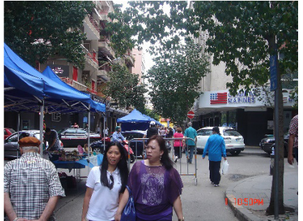
Figure 6. Temporary marketplaces reflecting social spaces in (left to right) Mar Mikhael, city center in Beirut Souks, and Makdissi Street.