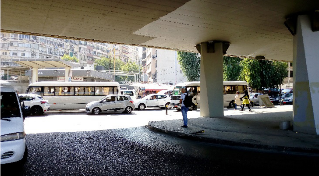
Figure 5. Mobility as social space, identified through riders' practices, available conceived spaces, and lived spaces of the informal transportation system at the Cola Roundabout.