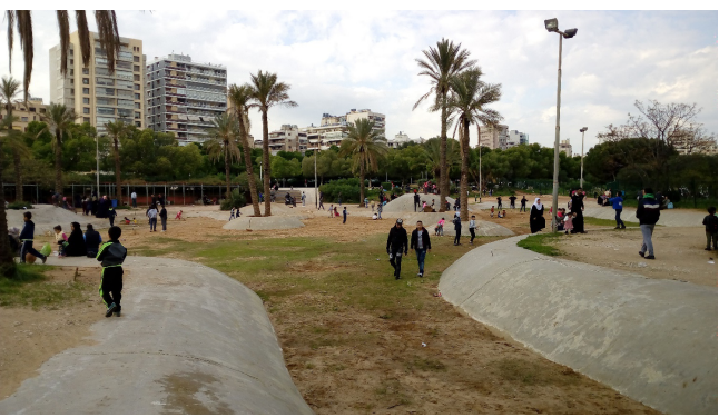
Figure 4. Martyrs Square and the Pine Forest turn into social spaces when activated by people's practices and their appropriations with signs, symbols and objects, and placemaking.