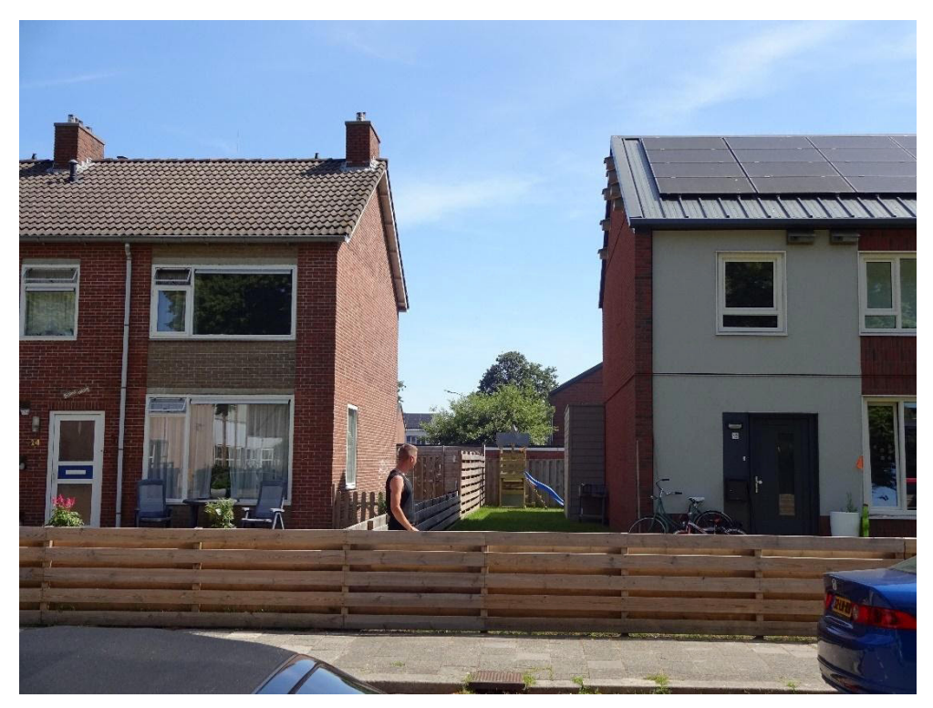
Figure 2. Stadskanaal. On the right, we can see a resident is in his garden, satisfied with his new house. On the left and in other houses of the district the renovation project did not take place because the residents were opposed to it.

innovation for the project consortium—are the installation of photovoltaic panels, a heat pump, and an external plant room (Figure 3) to manage the operation of the building's energy system and mechanical ventilation system, the residents are more interested in very practical and much less structural questions, such as the electric hob that replaces their gas cooker. This is in fact the issue around which opposition tends to crystallise,