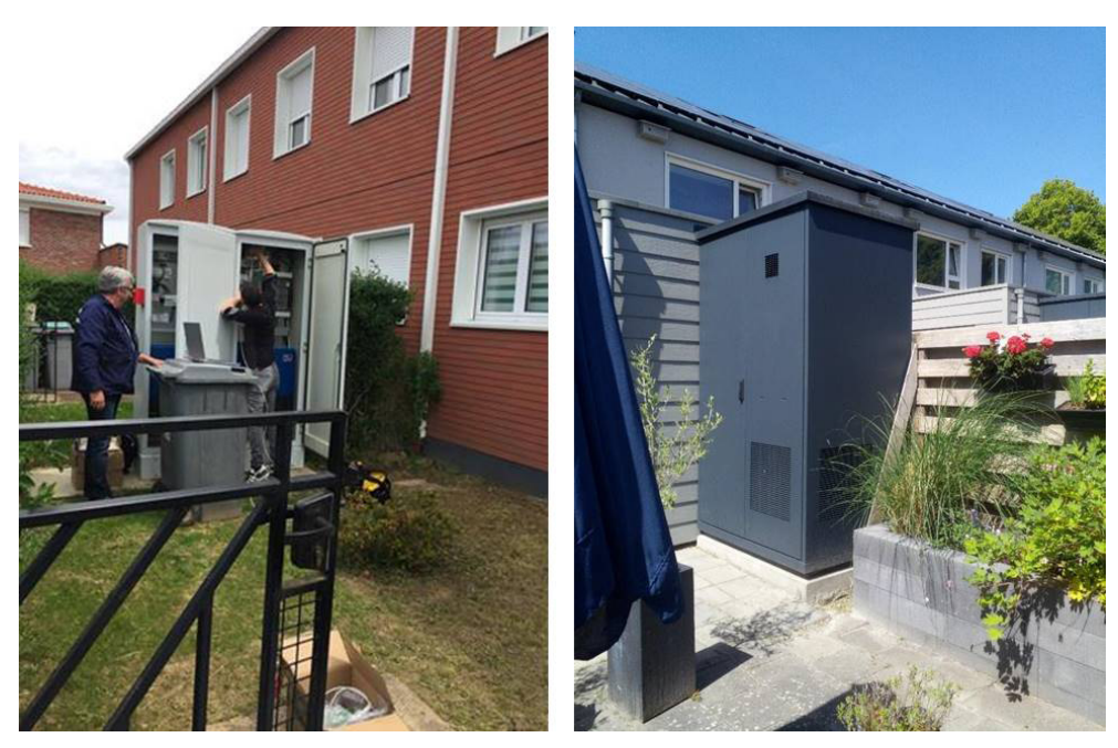
Figure 3. External plant room installed in the garden in Hem (France) and Stadskanaal (Netherlands).

as one French design office project manager told us: "Removing their gas, that's also something that is difficult to explain to people" (Member of technical engineering firm 1). Some landlords even end up covering the costs associated with ditching gas, which is a change that can also put people off the project, in particular the need to acquire a whole new set of appropriate saucepans and frying pans.