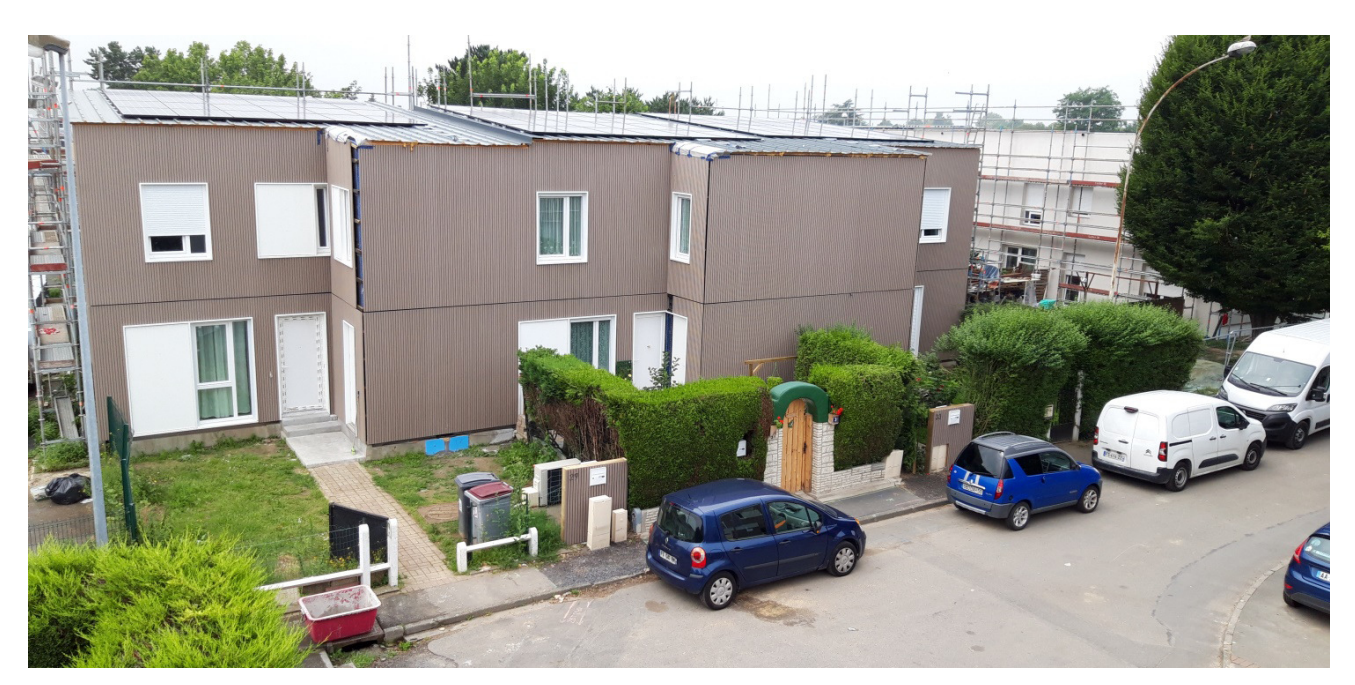
Figure 5. Wattrelos. Once the renovation is complete, residents can reappropriate their homes.