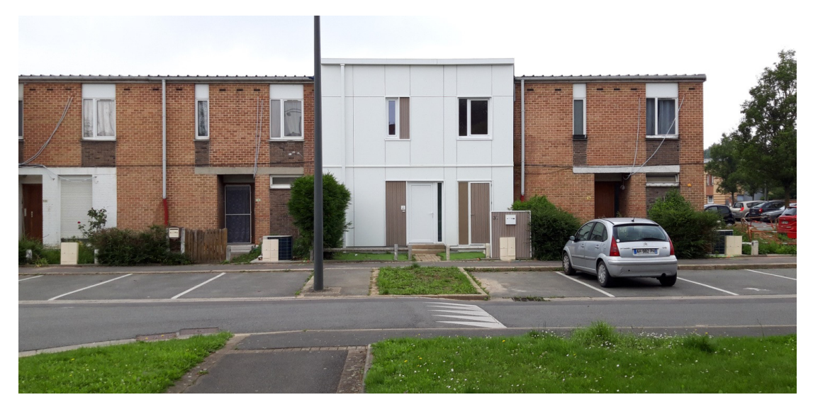
Figure 1. A prefabricated facade for a renovated house in Wattrelos.

do that, we have mobilized a large body of literature. In this corpus, three areas of study seem particularly relevant for our study: The first one explores domestic energy behaviour (Frederiks et al., 2015; Lutzenhiser & Gossard, 2000; Steemers & Yun, 2009) and, specifically, in relation to the use of new technologies and the materiality of the domestic space (Shove, 2003; Stephenson et al., 2010); the second one focuses on high-performance energy renovation projects (Gianfrate et al., 2017; Gupta & Gregg, 2016); and the last one is dedicated to the comprehension of the "energy performance gap" (Gram-Hanssen & Georg, 2018; McElroy & Rosenow, 2019; Topouzi et al., 2019; Zou et al., 2018) and of the procedures designed to deal with it, such as the EPCs (Jain et al., 2017; Lu et al., 2017; Zhang & Yuan, 2019). The analysis of literature on EPC reveals a paucity of studies, putting this contracting form in perspective with the behaviour of the occupants by illustrating the impacts that it can have on the latter, which is the perspective adopted by our study.