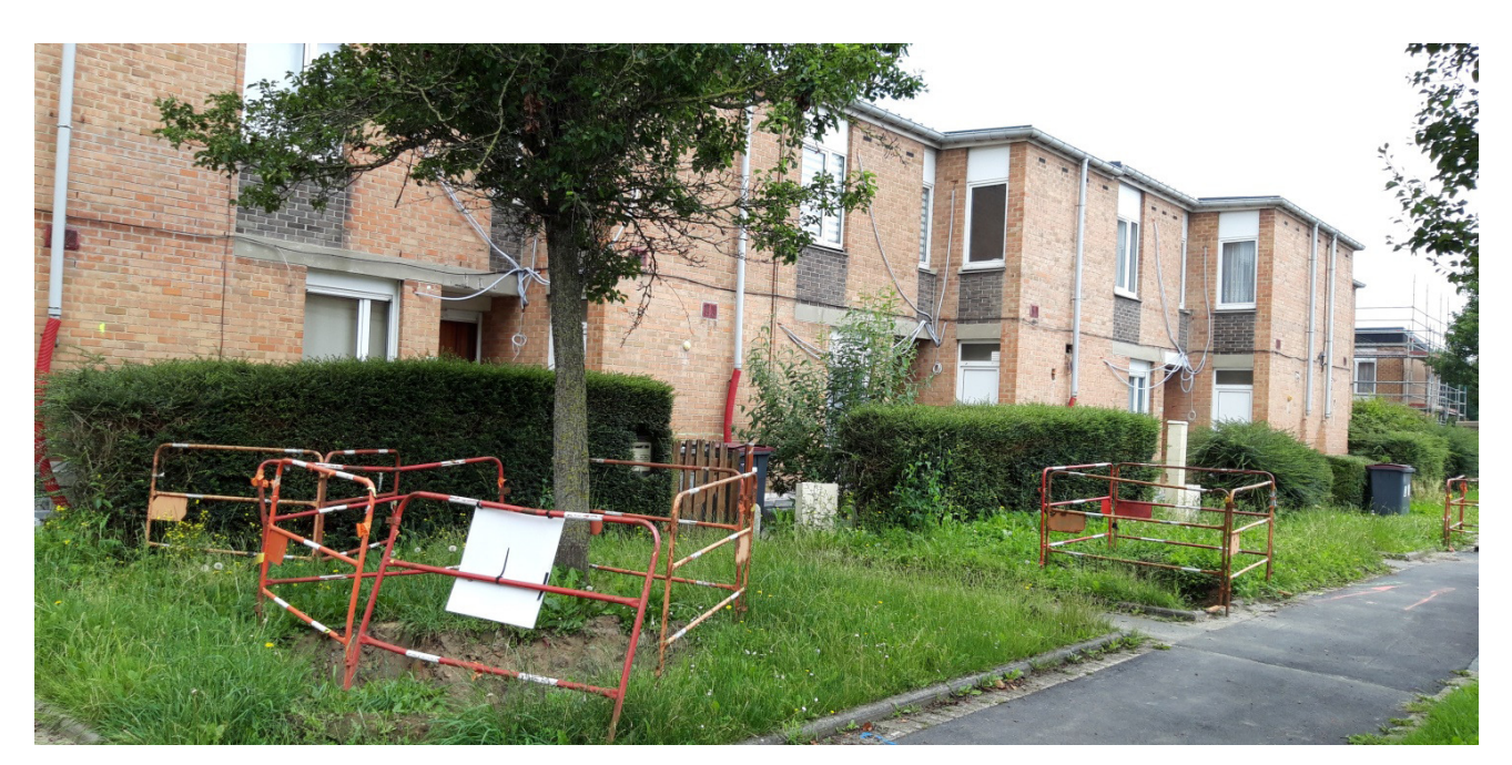
Figure 4. Public space affected by energy network upgrade in Wattrelos.

While some companies apply the learning by doing and treat this complexity as an opportunity to develop the business and their skills in working on an occupied site, others fail to cope with the challenge. As a result, the quality of the work and the relationship with tenants are compromised, and the landlord and contractors tend to blame each other for the failure (interview with the project representative of a Dutch construction firm). In addition, our interviews reveal the lack of foresight, on the part of both the landlords and the occupants themselves, about the upheaval produced by the speed of the spatial changes during the work: "At certain point when