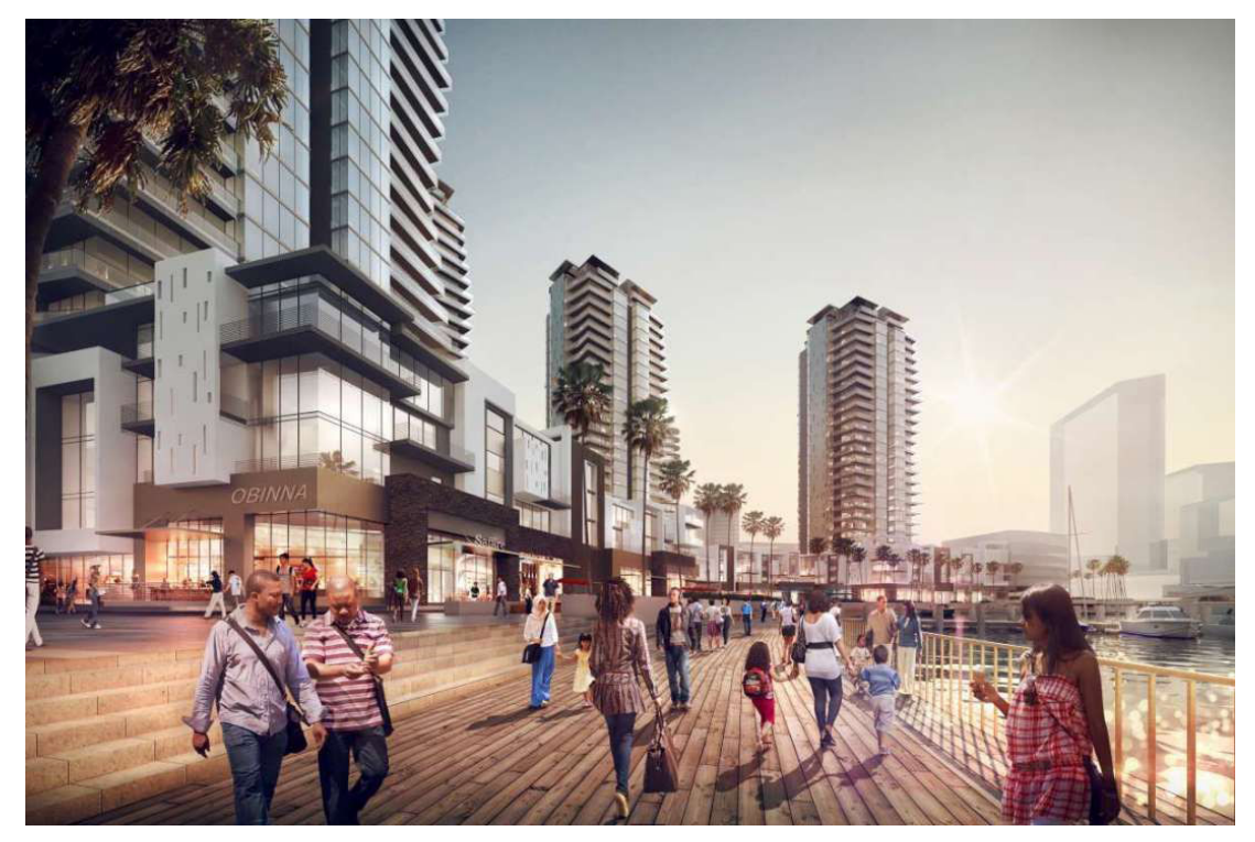
Figure 2. A rendering of the marina for Eko Atlantic.

In this context, our analyses furthermore revealed that because of this social complexity, the aspects that are atmospherically inscribed in renderings via digital collage are typically constructed in a collaboration between visual artists and architects, developers, and sometimes other actors as part of a longer planning process. As some visual artists described, integrating various stakeholders within the different planning phases and incorporating their points of view into the image construction were crucial for the rendering and, ultimately, the building project to gain reality in everyone's eyes.