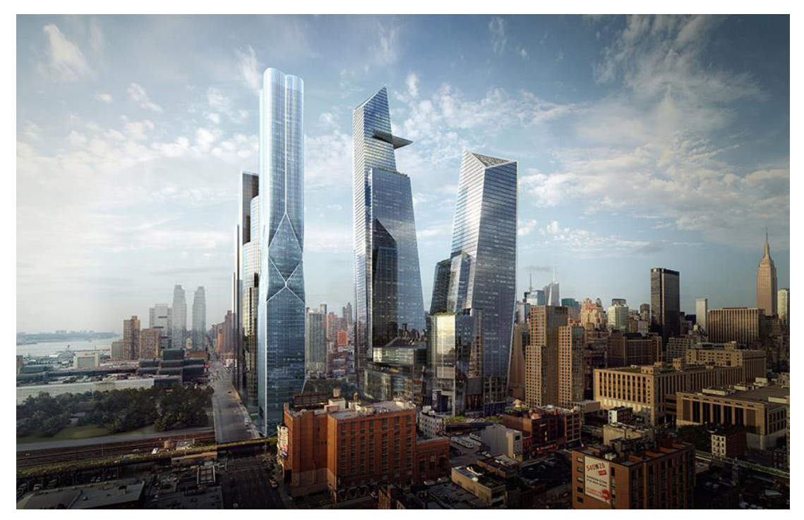
Figure 1. A rendering of Hudson Yards in Manhattan.

we can perceive it in reality, namely through certain colours, reflections, shadows, etc. As one visual artist said in an interview: