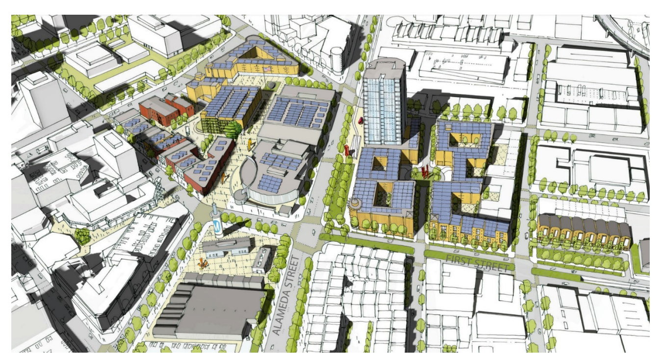
Figure 2. The conceptual design framework that came out of the SLT 2013 visioning process, focusing on new community-oriented development on three major publicly owned parcels of land in Little Tokyo.

One of the key insights to come out of the SLT visioning process was the identification of three major parcels of publicly owned land that could be "make or break" development opportunities for Little Tokyo, as described by one interview subject. The first parcel was the Regional Connector site which, beyond its rail station, had its remaining space open for development possibility. Additionally, there was the Mangrove site, a large, open industrial plot of land slated to be used as a construction staging site for the Metro development, and the First Street North site, a large, city-owned parking lot just to the north of the historically designated First Street North strip of buildings at the heart of Little Tokyo. Acknowledging the importance of the "unseen layer" of property rights, as one interviewee described,