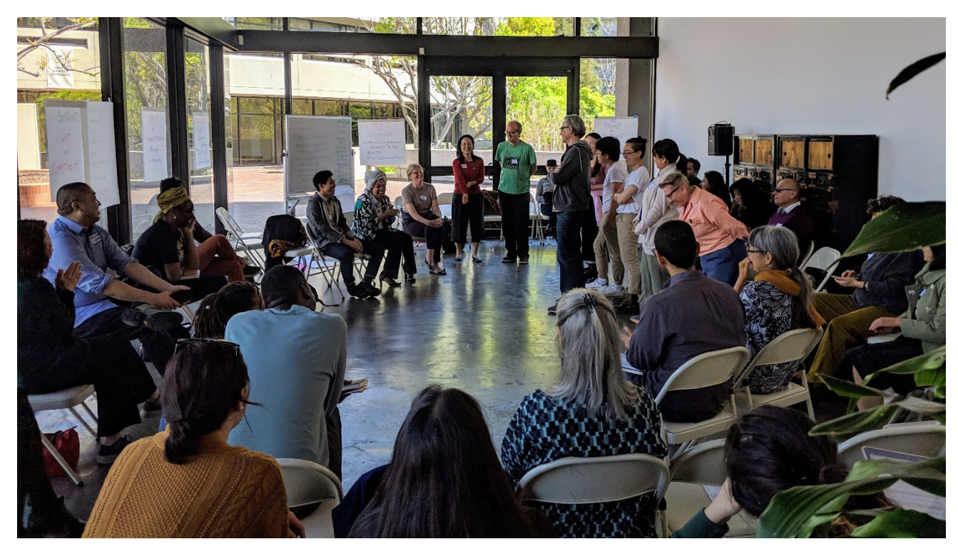
Figure 3. Horizontal co-creation in action at a Little Tokyo Cultural Organizing Workshop organized between multiple community organizations in Little Tokyo and community and arts organizations outside of Little Tokyo.

Over the course of the day, we engaged in multiple art-based activities and methodologies for understanding the pressures that different communities were facing, and for collective problem solving and visioning for the future of our respective communities. Representatives from the Los Angeles Poverty Department, a noted theater group based in Skid Row who uses "theater of the oppressed" methods (Boal, 1985), led the group in theater-based exercises to think through what issues