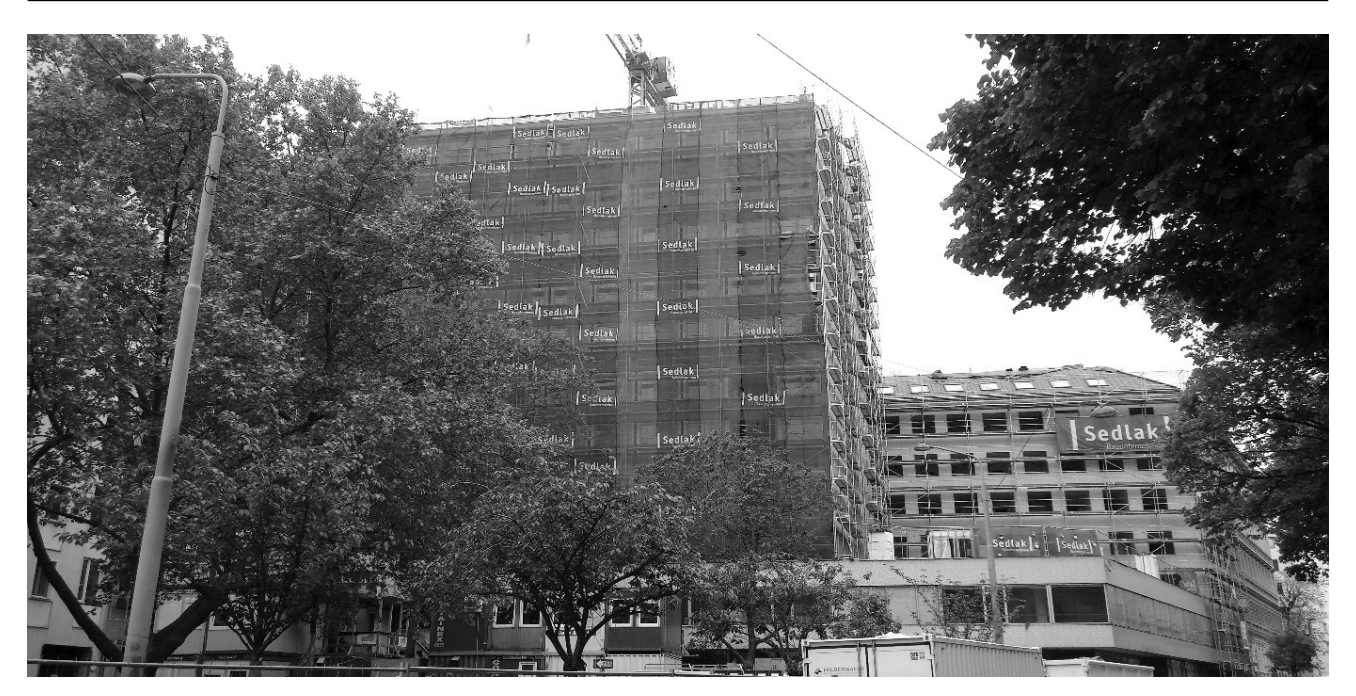
Figure 4. Traditional centrally located NP student accommodation from the 1970s under renovation.

and requested (e.g., waiting lists to receive a place in a PBSA) is now more accessible, which makes it easier for students in search of accommodation, but more competitive for the providers.