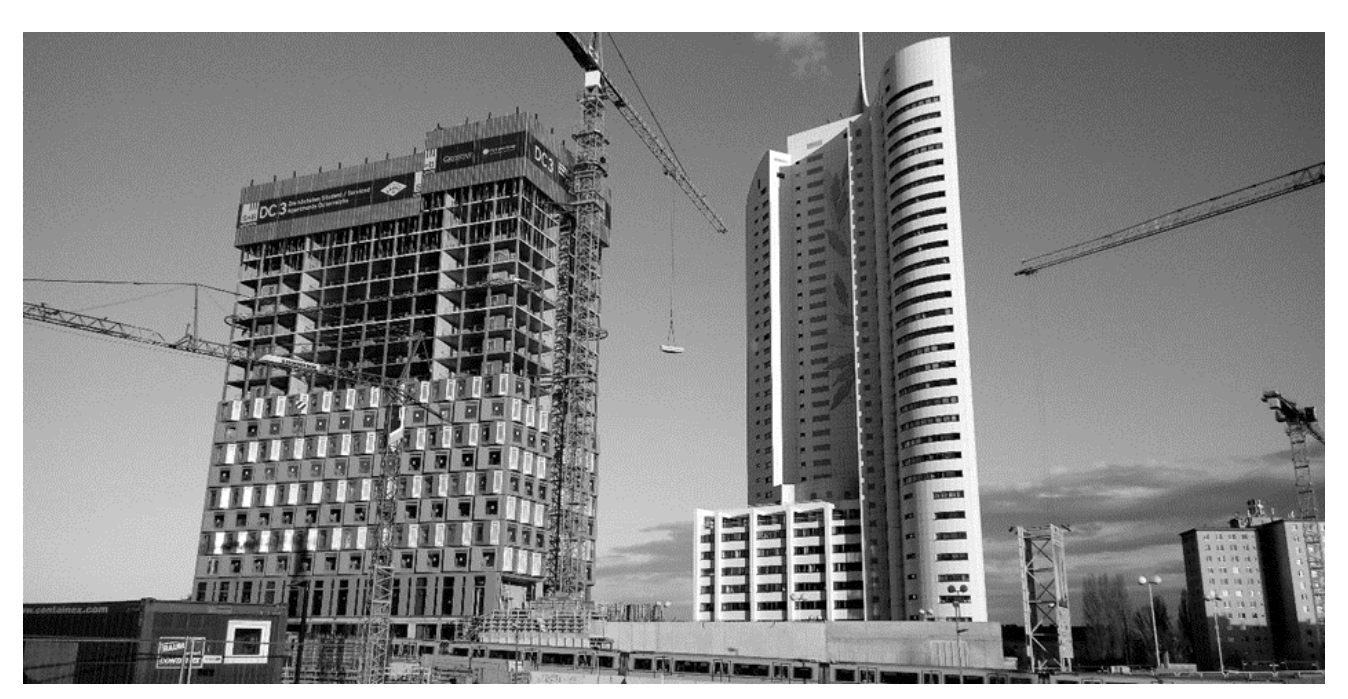
Figure 3. Student accommodation under development and a high-rise building promoted as the tallest student apartment building by an FP investor in Vienna.

While all interviewees from the group of FP providers mentioned the potential for expansion and even expressed plans for developing new student accommodation, all interviewees from the NP group found the market to be rather saturated. Most NP providers (NP1, NP3) reported that their current focus is rather on renovating existing locations and improving qualities and standards rather than expanding to new locations. Traditional NP student accommodation providers have been operating for decades or longer and reported on saturation in demand for student housing. Waiting lists rarely exist, and where they do, this tends only to be for specific, particularly desirable locations. NP interviewees expect the student housing market to stabilise from the recent state of expansion to a somewhat more consolidated market, with a few of the current student housing providers dropping out, for example, through mergers or sell-offs. Furthermore, there are expectations that certain providers would employ diversification strategies, thus changing their concept over time (NP2). For instance, rather than developing accommodation for students only, other temporary housing options are expected to be made available to non-student target groups. The Covid-19 pandemic might also have a bearing on this, in that the pandemic has heavily influenced the demand for student housing, with many students