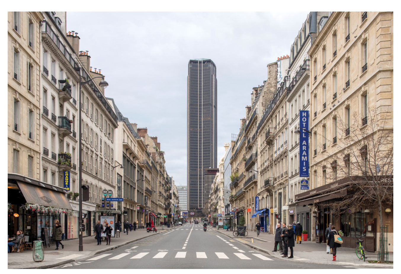
Figure 1. Tour Montparnasse, Paris.