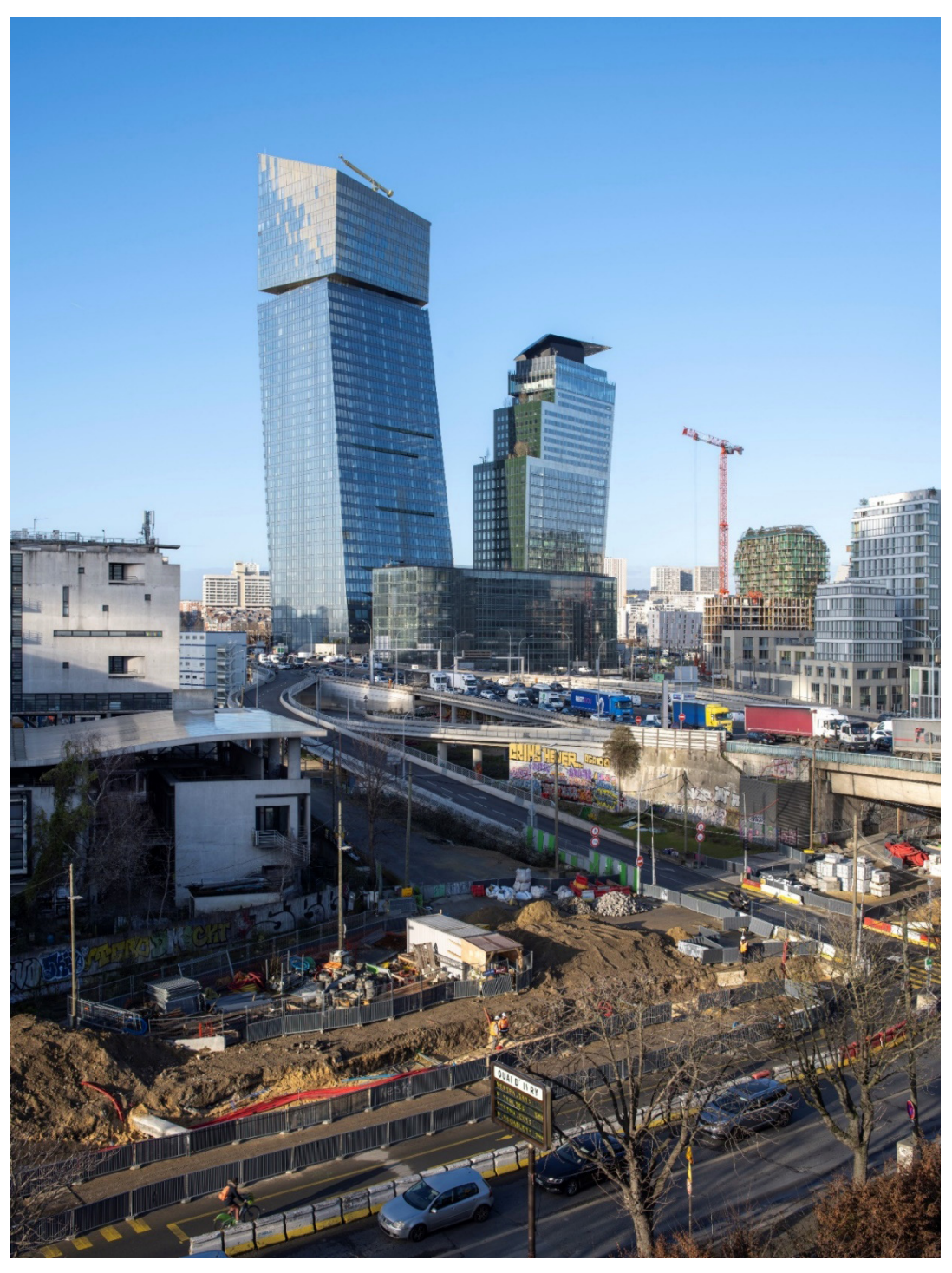
Figure 2. Tours Duo, Paris.

courthouse in the Clichy-Batignolles district; the architects Herzog & de Meuron are behind the design of the Triangle building to be erected at the Porte de Versailles exhibition center; and the Atelier Jean Nouvel designed the Tours Duo 1 & 2 built in the Masséna-Bruneseau quarter (Figure 2). It is no coincidence that all of these architects have made a name for themselves primarily through the design of museums or concert halls and have a comparatively "artistic" image (Foster, 2011; Gravari-Barbas, 2020).