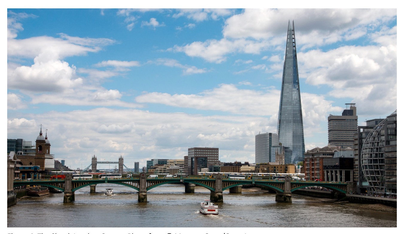
Figure 4. The Shard, London.

a cardinal virtue even though it barely stands up to a reality check-generally speaking, the taller a building is, the more its densification potential and resource efficiency decline, mainly due to safety, distance, and zoning regulations. This was clearly pointed out by a commission engaged by the British parliament as early as 2002 about the planned towers in London (House of Commons, Transport, Local Government and the Regions Committee, 2002). Significantly, municipal and planning authorities have also justified the push for vertical construction with the argument that tall buildings are "appropriate" to the appearance and representation of London (Tavernor, 2004). Such justifications, which relate to symbolic and aesthetic criteria, have typically involved the use of metaphorical language which draws parallels between structural verticalization and figurative vertical aspirations and emphasizes London's supremacy as a world metropolis in Europe. In a political position paper, for example, former mayor Ken Livingstone advocated high-rise construction in London as follows: "London must continue to grow and maintain its global pre-eminence in Europe. London must continue to reach for the skies" (Greater London Authority, 2001, p. 4).