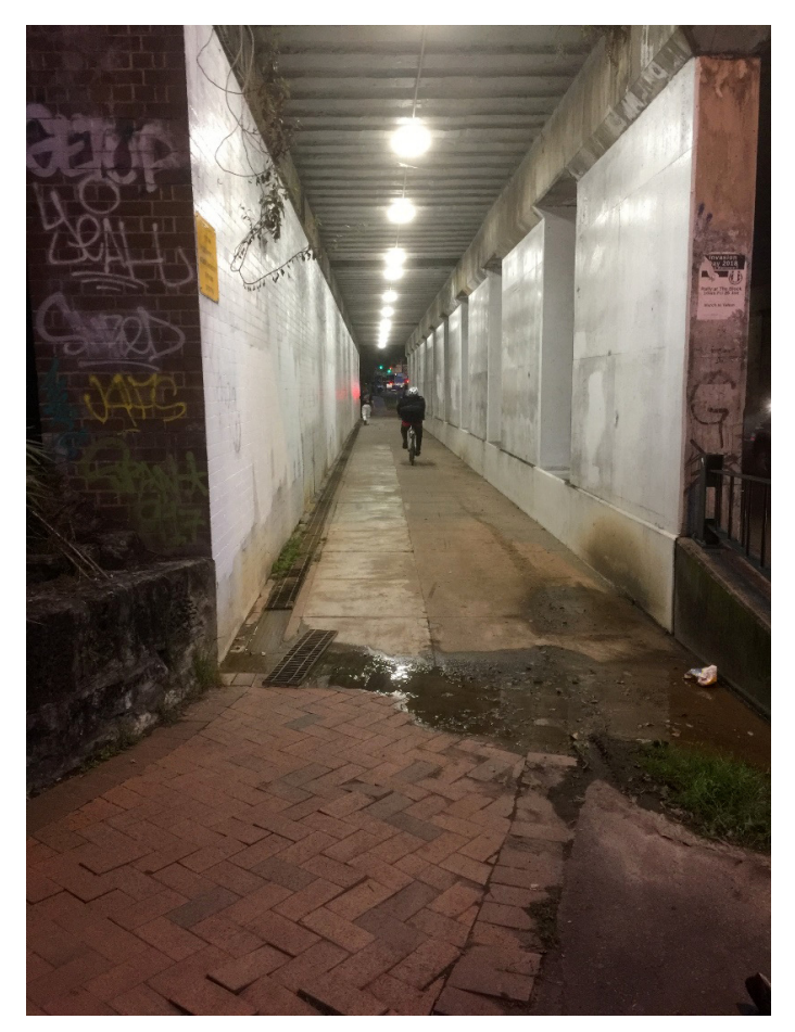
Figure 5. Underpass under the railway tracks in Upper Strathfield.