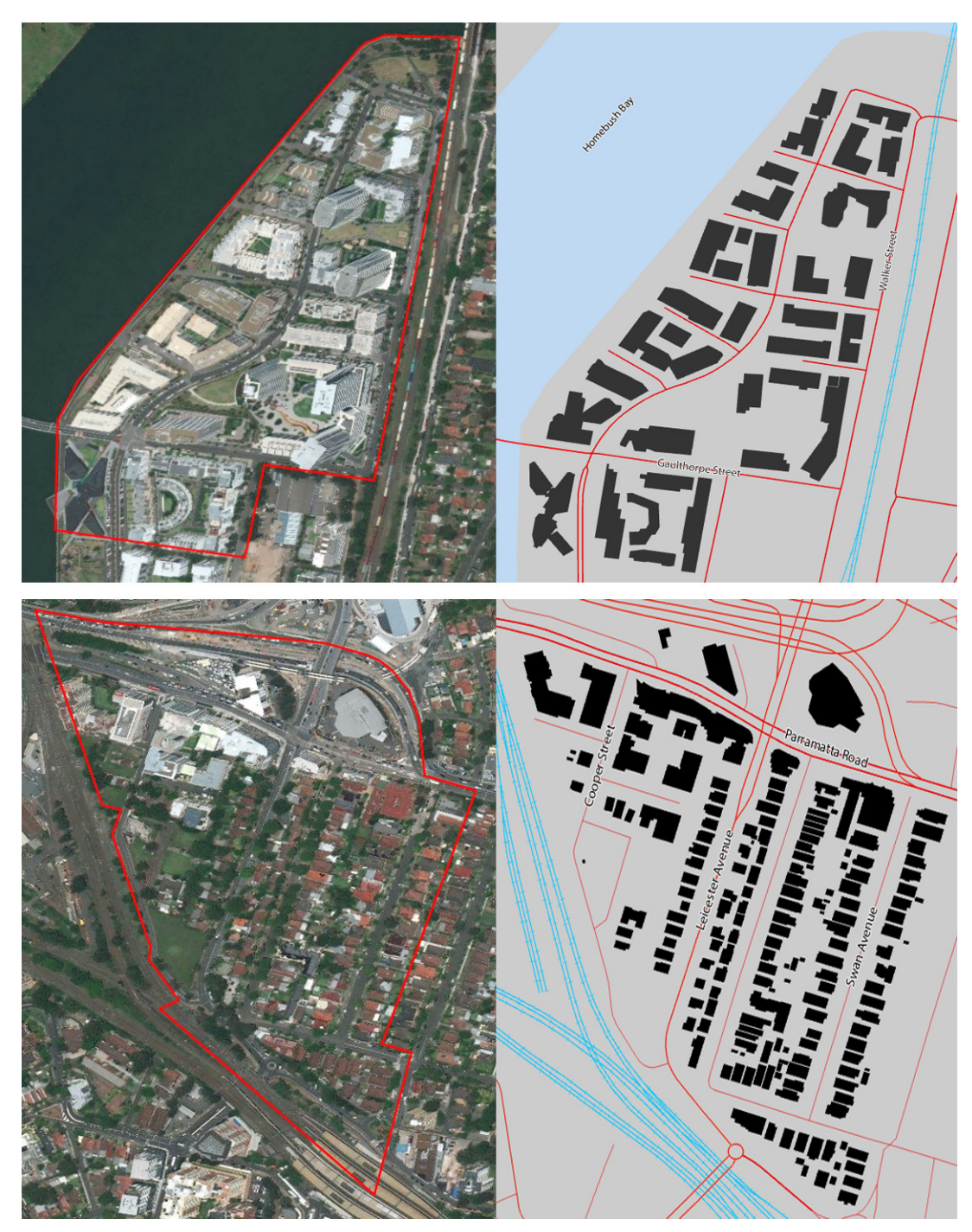
Figure 2. Rhodes West (top) and Upper Strathfield (bottom).

with several buildings over 20 storeys, Rhodes West benefits from a variety of public open spaces and water views that provide a sense of spaciousness. Most buildings maintain a positive connection with their streets providing a high level of passive surveillance. Wide roadways and footpaths ensure a comfortable scale in streets even where buildings are tall. However, the tall buildings cast shadows over the public realm and wind flows are higher in the neighbourhood than in surrounding areas. Footpaths are smooth and obstacle-free, and there are many places to sit. There was little traffic at the various times the research team visited. Buildings, streets,