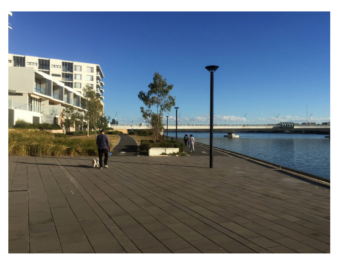
Figure 3. Rhodes foreshore, looking south across Homebush Bay.

Residents told us that a main benefit of the area was that "everything is convenient" (Strathfield resident 2) with easy access to train services, buses, and local shops. This convenience and the affordability of housing in the area relative to other parts of Sydney were seen to make the precinct good "value for money...for working families" (Strathfield resident 1). However, the closest parks and children's playgrounds are about one kilometre away, there is no community centre, and there was nowhere local to "hang around" or to "meet and talk" (Strathfield resident 1). Heavy and constant traffic also made walking around the area unpleasant. Focus group residents highlighted a need for more pedestrian crossings, with walking journeys to Strathfield station lengthened by the unavailability of safe and convenient crossing locations.