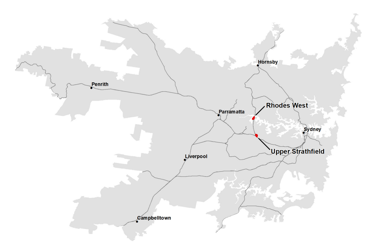
Figure 1. Case study locations.

Despite being in the same LGA (see Figure 1) and having both undergone large-scale redevelopment since the early 2000s, the case study neighbourhoods reflect