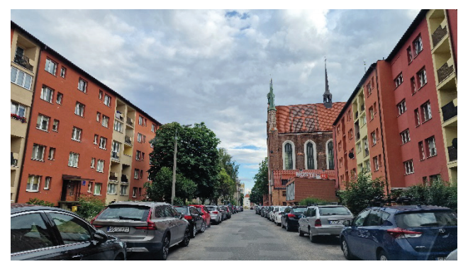
(d) Gdańsk: Rzeźnicka Street