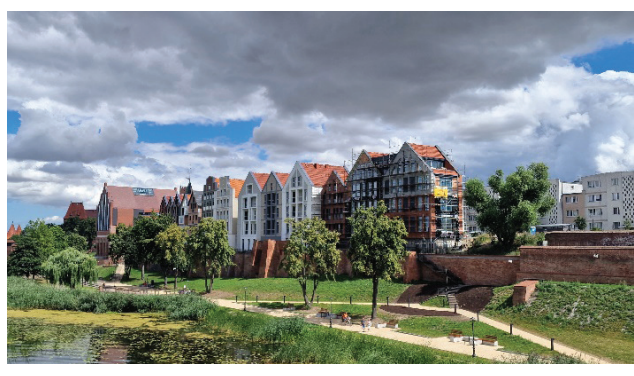
(c) Malbork: New complex in the forefront of the Old Town