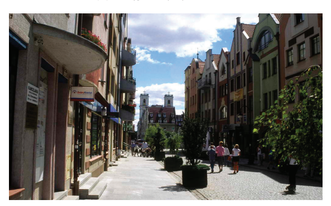
(d) Głogów: Grodzka Street