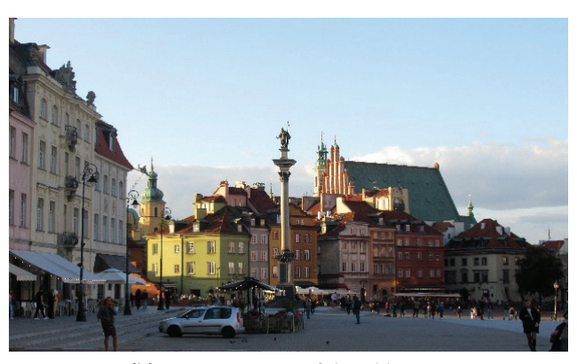
(b) Warszawa: View of the Old Town and Royal Castle Square