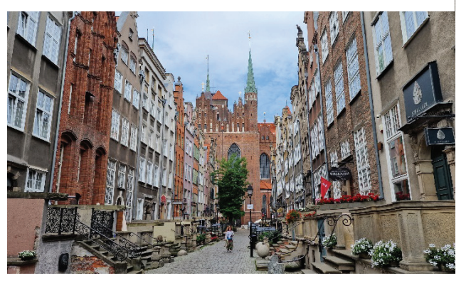
(d) Gdańsk: Mariacka Street