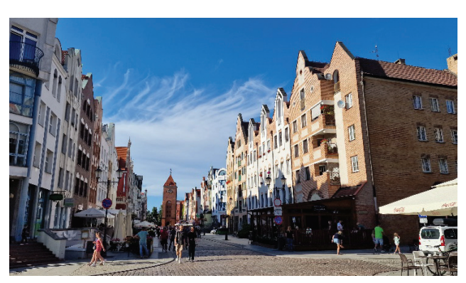
(b) Elbląg: Stary Rynek Street