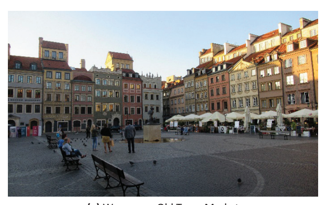
(a) Warszawa: Old Town Market

Although, paradoxically, this specific concept of postwar reconstruction—defined as a means of restoration of the centre of national identity, the Old Town of the Polish capital—was also used to recreate the centres of former German cities such as Wrocław (Czerner, 1976; Małachowicz, 1985) and many others, including Gdańsk (Massalski & Stankiewicz, 1969; Stankiewicz & Szermer, 1959; Szermer, 1971; Figure 2), it was applied to very