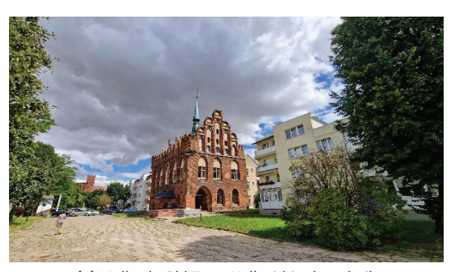
(a) Malbork: Old Town Hall within the rebuilt structures of the Old Town

Since the late-1950s, on many such sites, new districts have been erected in the style of socialist modernism, increasingly departing from the traditional model of the European city. What also made this period different from the Stalinist era was the fact that rebuilding processes were undertaken in the case of many cities, including numerous small and medium-sized ones. In these cases, new housing districts have been developed with the usage of industrialised technology on a large scale (Skolimowska, 2013). One such realisation is Malbork's Old Town—as well as Braniewo, Kwidzyn, Kołobrzeg, Nysa, Legnica, Lwówek Śląski, and secondary old towns in larger cities, such as Stare Przedmieście in Gdańsk or Nowe Miasto in Wrocław (Bugalski, 2014; Figure 3). The author of the rebuilding concept for Malbork, Szczepan Baum, argued that there can be no compromise or intermediate phases between a strict historical reconstruction and the contemporary shaping of space (Baum, 1961). Indeed, although Malbork's Old Town layer loosely refers to the historical city plan, it is almost impossible to identify former public spaces of the city with its main compositional axis of the elongated