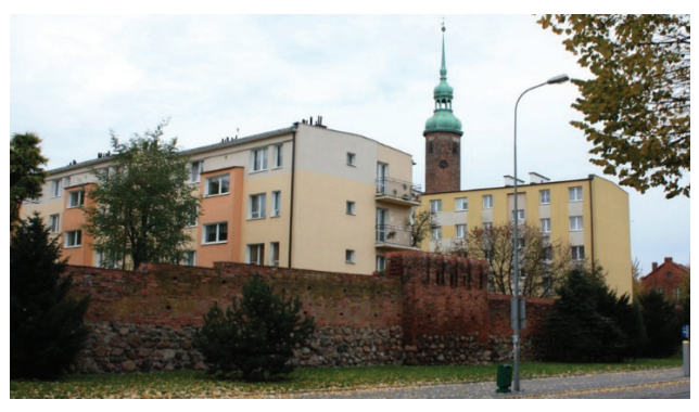
(c) Słupsk: Old Town as seen from Jagiełły Street