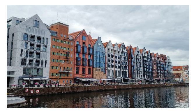
(a) Gdańsk: Granary Island