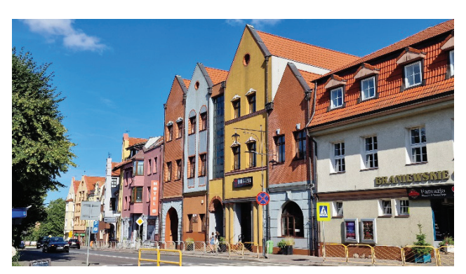
(d) Braniewo: New complex in the vicinity of the Cathedral Church