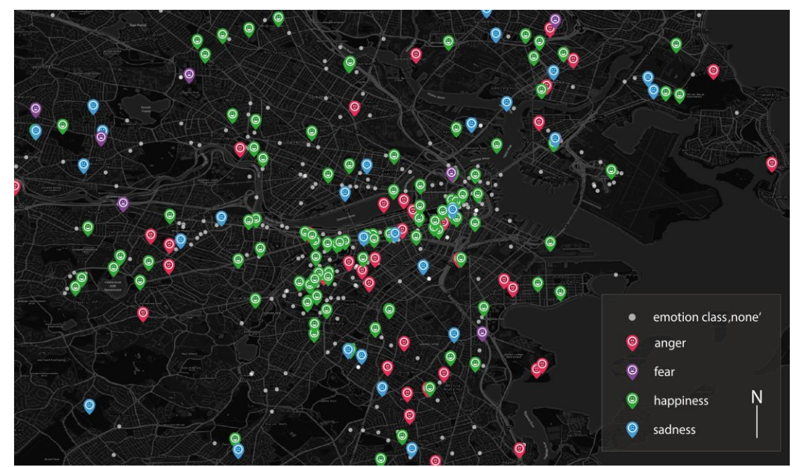
Figure 2. Spatial distribution of the gold standard.

First, we performed a seed selection, i.e., a random selection of seeds from the gold standard, to make sure that all runs in one experiment use the exact same training and test dataset. Second, our algorithm calculated the optimal combination of feature groups. The linguistic features are selected in an iterative approach, i.e., feature groups are added one by one, and the best combination between feature groups is finally applied, where "best" means the highest evaluation result (see Subsection 3.5). Then, the optimal parameter settings for spatial and temporal similarity are computed analogously. Third, we carried out the labelling procedure with the following parameters: amount of unlabelled data (5,000), the number and distribution of seeds (happiness: 70, sadness: 20, anger/disgust: 30, fear: 4, none: 70), the edge weight threshold (0.5), and the weighting parameters for the three dimensions linguistic (1.0), temporal (5.0), and spatial (5.0) similarity. These parameter values turned out to be the best ones