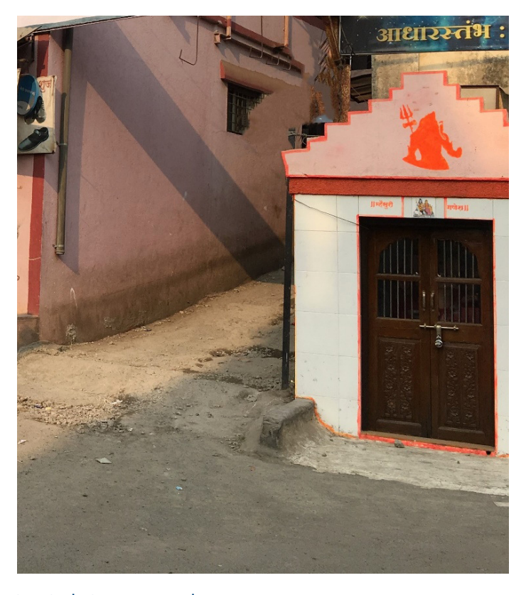
Figure 4. A mandal constructed at a crossroad.