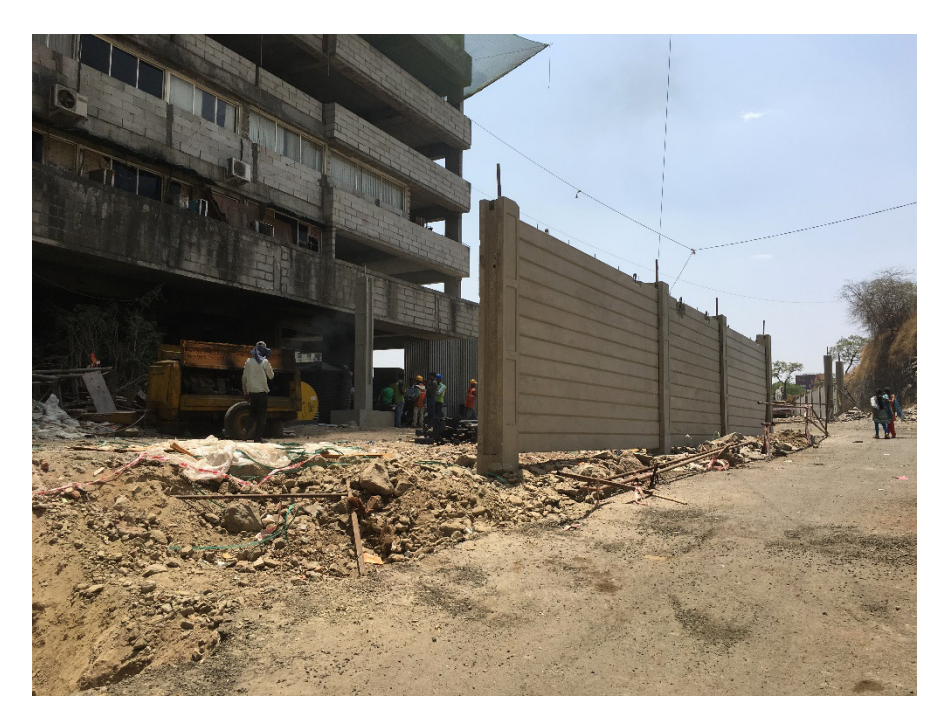
Figure 3. Wall separating free-sale apartment building (on the left) and access road to rehabilitation building (on the right).

Rambhau told me that "the builder is building the wall for his benefit; the wall is not for slum residents' benefit." Rambhau's remark resonates precisely with Breitung's (2011) observation that market logic produces territorial separation for profit-making purposes. A private developer corroborated the fact that separating slum-rehabilitation buildings from free-sale buildings helps in making the free-sale apartments financially comparable to other non-slum development schemes in Pune. Without the conspicuous separation between the slum site and the free-sale site, the prices of the free-sale apartments are much lower. Consequently, the developer was constructing a wall to separate the free-sale housing units from rehabilitation units to attract rich buyers. However, the wall was initially planned to be constructed very close to the hill (on the right-hand side in Figure 3) and the rehabilitation buildings would not have gotten a decent vehicular access road. In effect, the wall triggered and perpetuated the secondary citizenship treatment that the identity of "slum-dwellers" also produces, even after the settlement residents had moved into rehabilitation apartments. Vlassenroot and Büscher (2013) argue that urban development at the borderlands generates a socio-political struggle for identity. But Rambhau's struggle to shift the compound wall a few meters sideways was not to maintain the identity of a slum-dweller but to undo it. Rambhau said to me: