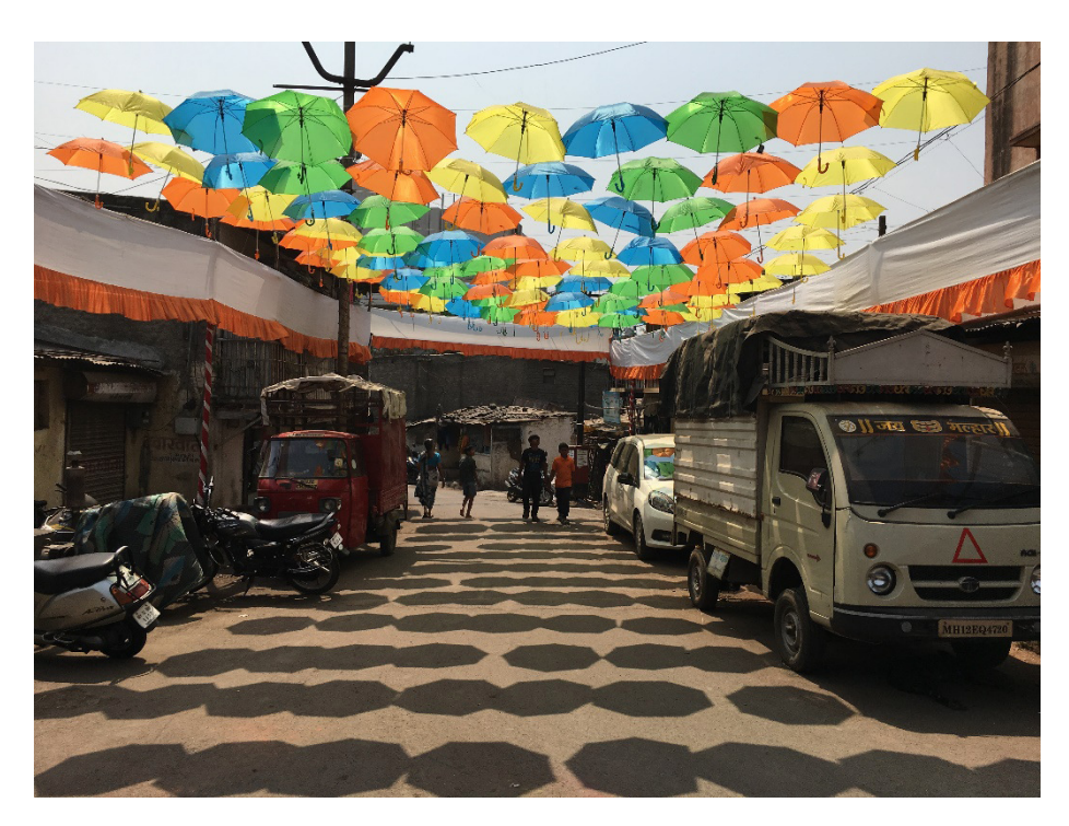
Figure 6. A vehicular/pedestrian road temporarily decorated for celebrations.

practice, residents of the rivulet bank neighbourhood had negotiated and secured one floor in the rehabilitation building for all the neighbours from one alley. Residents expected to celebrate birthdays and Ganapati festivals in the corridors of each floor, retaining the socio-spatial logics of the neighbourhood alleys, thereby transgressing the strict private/public and vehicular/pedestrian binary divisions.