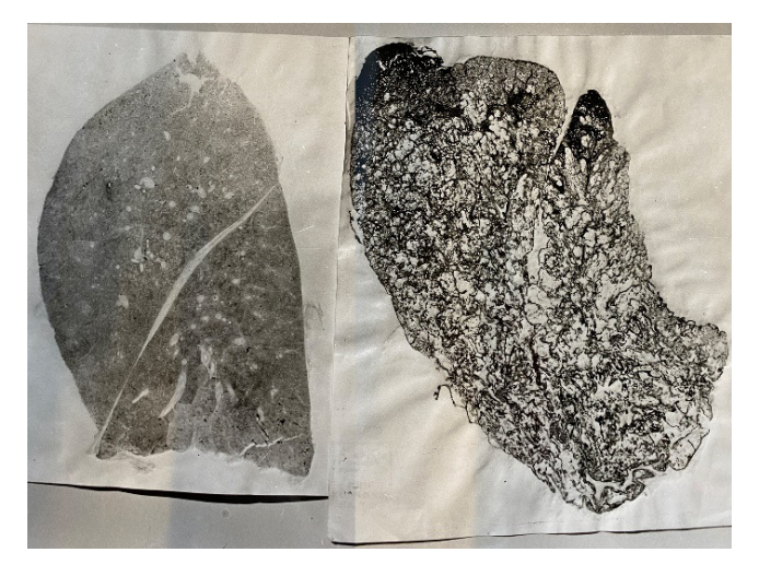
Figure 2. Comparison of lungs. Still from the Shell-Mex and BP Clean Air film for the 1962 Annual Conference and Exhibition of the National Clean Air Society.