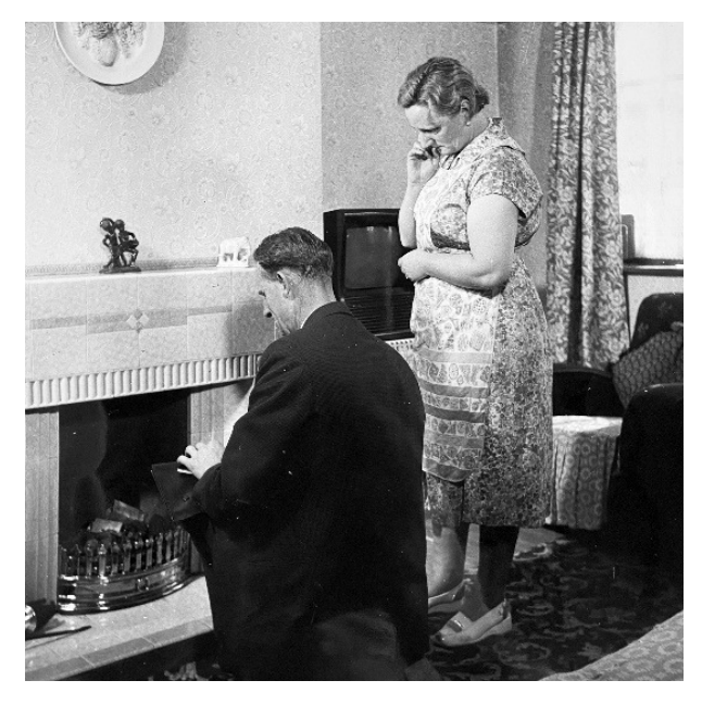
Figure 4. Local authority consultant during home visit: Still from the Shell-Mex and BP Clean Air film for the 1962 Annual Conference and Exhibition of the National Clean Air Society.