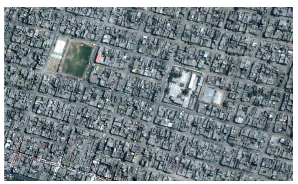
Figure 3. The streets in the Comás squatter community in Lima, Peru, are 10-meters-wide and take up 25% of the area. A 160m<sup>2</sup> house there now costs $180,000.

part, by acquiring the rights-of-way for arterial road grids now, by laying out streets now, and by acquiring lands for public open spaces now.