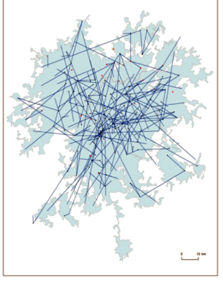
Figure 2. Los Angeles (left) and Atlanta (right) are integrated metropolitan labor markets: People live everywhere and work everywhere.