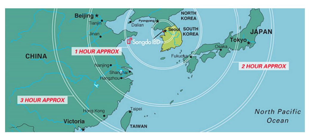
Figure 2. Location Map of Songdo (Songdo IBD from 2015), South Korea.