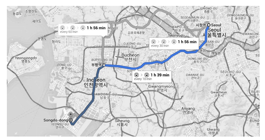
Figure 4. Commuting to Songdo by train.

One of the main problems found from administering a technocratic approach at a city scale, as in the case of Songdo, is the ability to cope with the challenges of so-