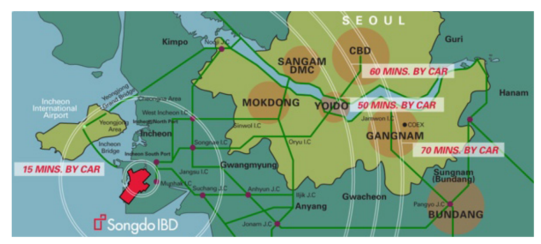
Figure 5. Commuting to Songdo by car.