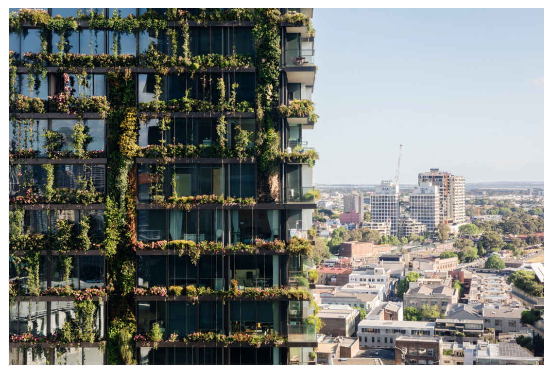
Figure 1. 'Central Park' Sydney, Australia: Biophilic façade.

Section 4 describes how urban planning can potentially resolve the two paradigms through integration, by utilising the spatial characteristics of different urban fabrics, i.e., by facilitating traditional GI approaches in less dense urban fabrics, and BU approaches in denser urban fabrics.