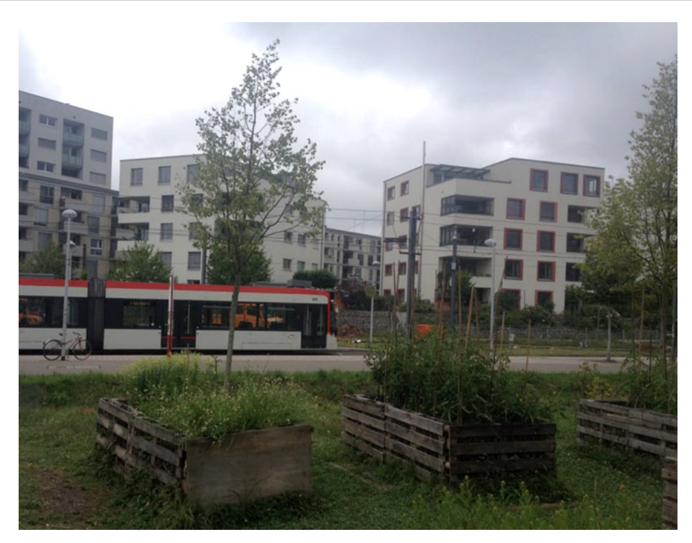
Figure 5. Vauban, Freiburg, Germany, a medium density transit urban fabric serviced by tramline with lawn base to mitigate noise and allow water infiltration surrounded by multiple house-based biophilic features.

to show how these dense areas can incorporate patches of urban nature, though very few have related their biophilic features to the underlying natural systems that can together integrate a resource efficient and ecological aspects right across the city.